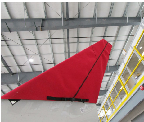
Bombardier Global Express Padded Winglet Covers