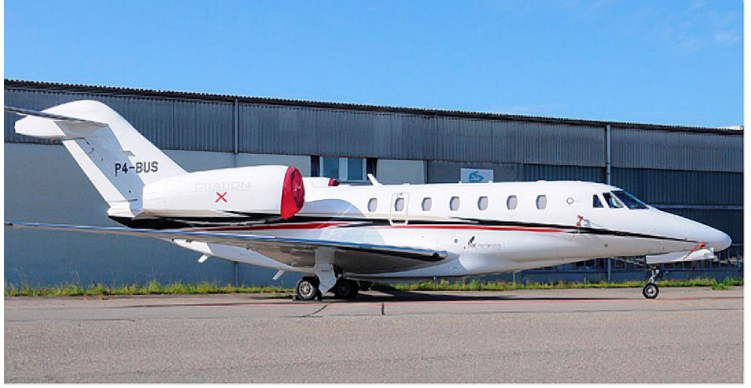
Citation X Intake & Pitot Tube Covers