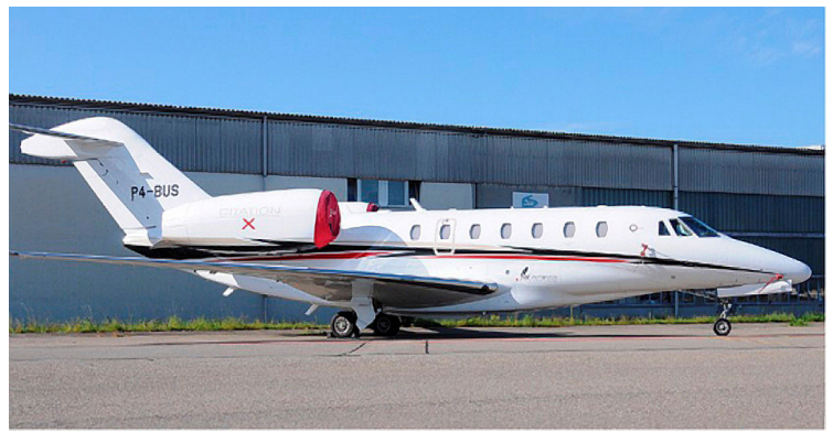
Citation X Intake & Pitot Tube Covers