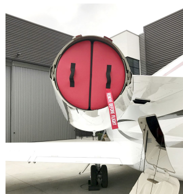
Cessna Citation 680 Exhaust Plugs, folding type