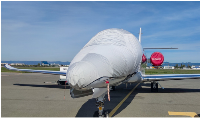
Cessna Citation Latitude (680A) Cockpit/Nose Cover, Doesn't Cover Pitot Tubes