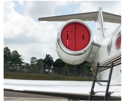
Grumman Gulfstream G450 Intake Plugs