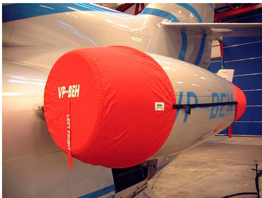
Falcon 900 Sovereign Engine Covers

The Cessna Citation Latitude (680A) Intake/Exhaust Plugs are custom fit for the intake and exhaust openings, made with heavy-duty vinyl material, and stuffed with a single block of sculpted urethane foam. Each plug has a zipper that allows the foam to be removed and dried if necessary. Engine plugs have 'remove before flight' streamers sewn onto the face of the plugs. Most plugs are imprinted with the aircraft registration number in black. Engine plugs may be inserted after flight when the engine is still warm. Engine Inlet Plugs are commonly referred to as Cowl Plugs, Intake Plugs, Cowl Blocks, Engine Blocks, and Engine Bungs.