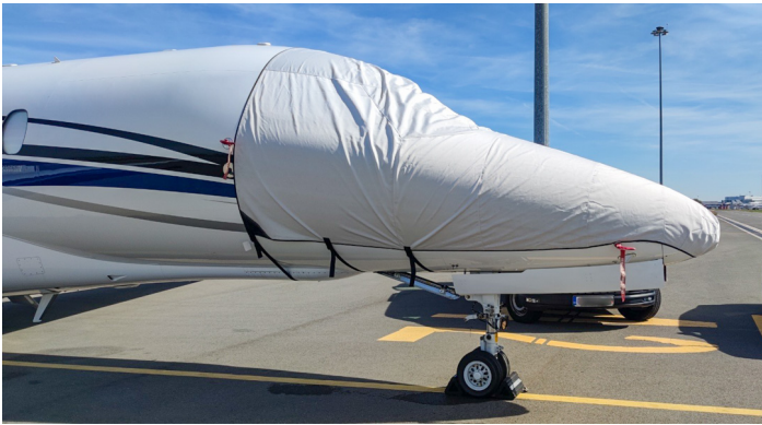
Cessna Citation Latitude (680A) Cockpit/Nose Cover, Doesn't Cover Pitot Tubes