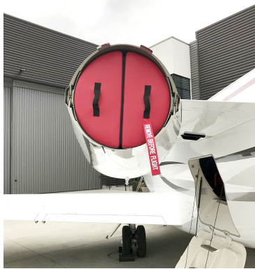
Cessna Citation 680 Exhaust Plugs, folding type

The Engine Inlet Plugs are custom fit for your Cessna Citation Latitude (680A) intakes, made with heavy-duty vinyl material, and stuffed with a single block of sculpted urethane foam. Each plug has a zipper that allows the foam to be removed and dried if necessary. Engine plugs have 'remove before flight' streamers sewn onto the face of the plugs. Most plugs are imprinted with the aircraft registration number in black for an extra charge. Storage bag NOT included. Engine plugs may be inserted after flight when the engine is still warm. Engine Inlet Plugs are commonly referred to as Cowl Plugs, Intake Plugs, Cowl Blocks, Engine Blocks, and Engine Bungs.