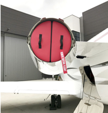
Cessna Citation 680 Exhaust Plugs, folding type