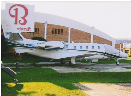
Citation XL Cockpit Cover & Bikini Type Engine Cover

The Cessna Citation VII (650) Intake/Exhaust Plugs are custom fit for the intake and exhaust openings, made with heavy-duty vinyl material, and stuffed with a single block of sculpted urethane foam. Each plug has a zipper that allows the foam to be removed and dried if necessary. Engine plugs have 'remove before flight' streamers sewn onto the face of the plugs. Most plugs are imprinted with the aircraft registration number in black. Engine plugs may be inserted after flight when the engine is still warm. Engine Inlet Plugs are commonly referred to as Cowl Plugs, Intake Plugs, Cowl Blocks, Engine Blocks, and Engine Bungs.