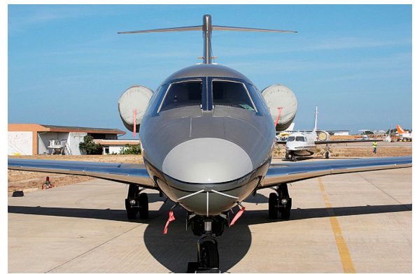
Citation III 650 Engine Covers Set