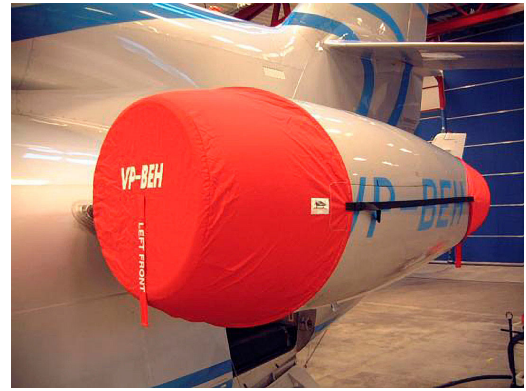
Falcon 900 Sovereign Engine Covers