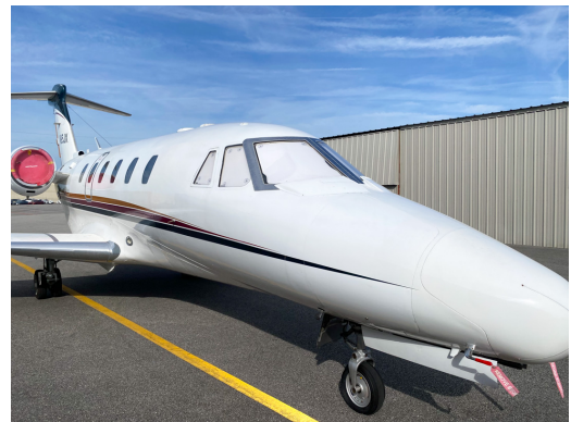
Cessna 650 Cockpit Heatshields (set of 6)