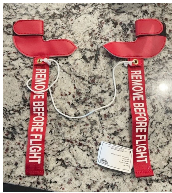
Cessna Citation Pitot Cover Set