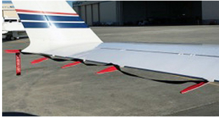
Static Wick Covers