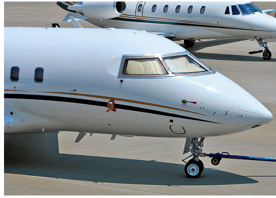
Challenger 604 Cockpit HeatShields