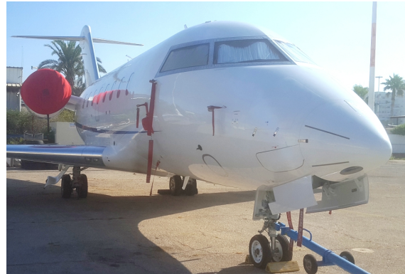
Canadair Challenger 604, 605, 650, 850 Intake Covers