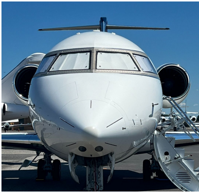
Bombardier CL-600-2B16 Cockpit Heatshields