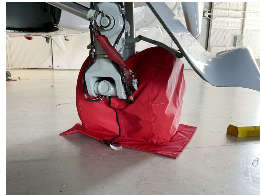
Canadair Challenger 605 Main Gear Tire Covers