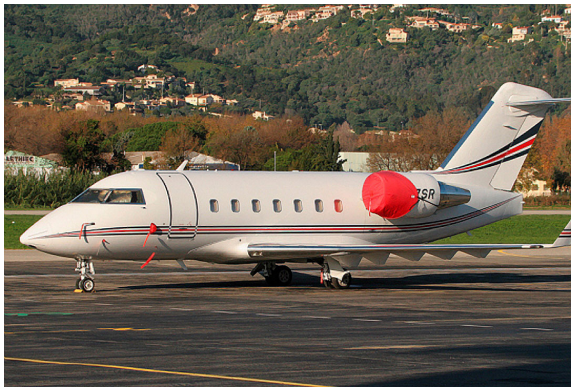
Challenger 601 Intake Covers, standard design

The Canadair Challenger 604, 605, 650, 850 Intake Covers are designed to install easily yet be completely storable. A spring steel hoop is sewn into the hem of each cover, allowing them to be installed without climbing onto the wing or using a stepladder. To store the covers the spring steel hoop folds like a band-saw blade into three nesting rings. Each cover folds into a compact circular bundle which is stored in the included duffle bag, yet they unfold quickly for use. The Tri-Fold Ring cover is made of medium weight nylon which is available in a variety of colors to match the paint trim. Each cover set comes complete with installation and folding instructions. The aircraft's registration number can be silkscreened onto the cover for an extra charge.