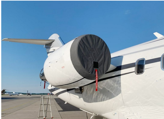
Canadair Challenger 604, 605, 650, 850 Intake/Exhaust Covers (OEM Design)

The Canadair Challenger 604, 605, 650, 850 Intake Covers are designed to install easily yet be completely storable. A spring steel hoop is sewn into the hem of each cover, allowing them to be installed without climbing onto the wing or using a stepladder. To store the covers the spring steel hoop folds like a band-saw blade into three nesting rings. Each cover folds into a compact circular bundle which is stored in the included duffle bag, yet they unfold quickly for use. The Tri-Fold Ring cover is made of medium weight nylon which is available in a variety of colors to match the paint trim. Each cover set comes complete with installation and folding instructions. The aircraft's registration number can be silkscreened onto the cover for an extra charge.