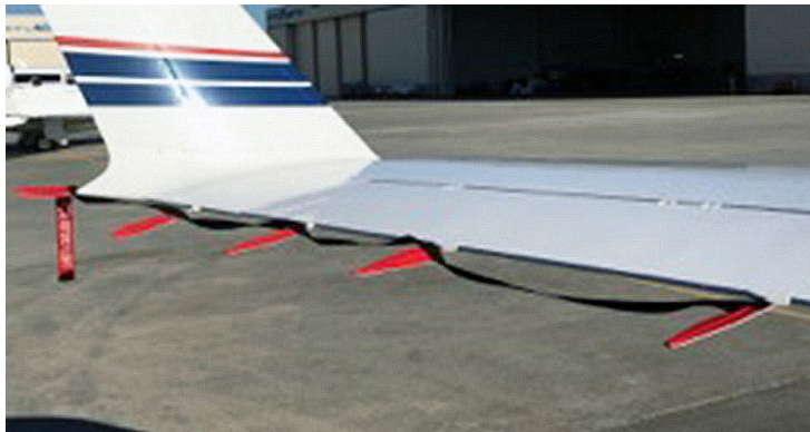
Static Wick Covers

with the aircraft registration number in black for an extra charge. Storage bag NOT included. Engine plugs may be inserted after flight when the engine is still warm. Engine Inlet Plugs are commonly referred to as Cowl Plugs, Intake Plugs, Cowl Blocks, Engine Blocks, and Engine Bungs.