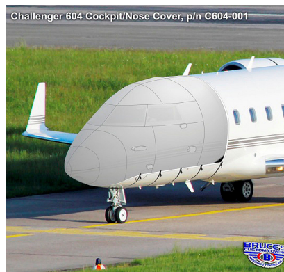
Challenger 601/604 Cockpit/Nose Cover, illustration

This cover type is made from Silver Acrylic Sunbrella canvas and is 100% lined with a soft and smooth microfiber. Bruce's Custom Covers developed this material combination especially for aircraft protection. The outer material is medium weight and treated for water resistance, UV resistance and anti-static buildup. The inner lining is a very soft and smooth microfiber to prevent scratching. The material is very reflective, and tests show that the cabin interior temperature can be reduced to near-ambient temperature on the hottest of days. It is water, ice and snow repellent, yet breathable to allow moisture to escape from between the cover and the aircraft surface.