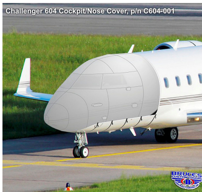
Challenger 601/604 Cockpit/Nose Cover, illustration

This cover type is made from Silver Acrylic Sunbrella canvas and is 100% lined with a soft and smooth microfiber. Bruce's Custom Covers developed this material combination especially for aircraft protection. The outer material is medium weight and treated for water resistance, UV resistance and anti-static buildup. The inner lining is a very soft and smooth microfiber to prevent scratching. The material is very reflective, and tests show that the cabin interior temperature can be reduced to near-ambient temperature on the hottest of days. It is water, ice and snow repellent, yet breathable to allow moisture to escape from between the cover and the aircraft surface.