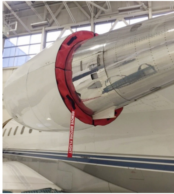
Canadair Challenger 604 Bypass Plugs

dried if necessary. Engine plugs have 'remove before flight' streamers sewn onto the face of the plugs. Most plugs are imprinted with the aircraft registration number in black for an extra charge. Storage bag NOT included. Engine plugs may be inserted after flight when the engine is still warm. Engine Inlet Plugs are commonly referred to as Cowl Plugs, Intake Plugs, Cowl Blocks, Engine Blocks, and Engine Bungs.