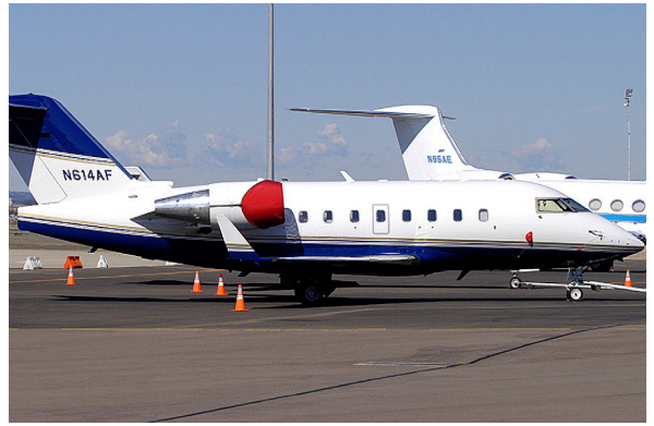
Challenger 604 Intake Covers, standard design