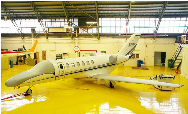
Cessna Citationjet CJ3 Cockpit/Nose, Engine & Wings Travel Covers

WINTER USE MATERIAL - Made with Solution-Dyed Polyester fabric, this option is intended for seasonal use to aid in deicing, rain mitigation, or for occasional travel. The material is lighter and more compact, but more susceptible to UV damage and may have a shorter useful life if used continuously outside than the all-year use material.