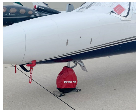
Cessna Citation Nose Tire Cover