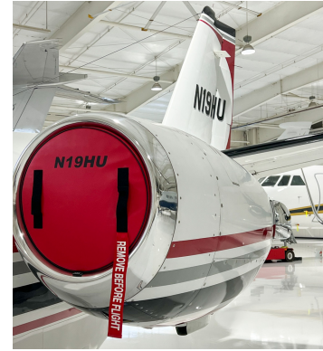
Cessna Citationjet V Ultra (560) Exhaust Plugs