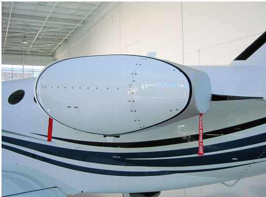
Cessna 510 Mustang Bikini Type Engine Cover

The Cessna Citationjet V Ultra & Encore Models Intake/Exhaust Plugs are custom fit for the intake and exhaust openings, made with heavy-duty vinyl material, and stuffed with a single block of sculpted urethane foam. Each plug has a zipper that allows the foam to be removed and dried if necessary. Engine plugs have 'remove before flight' streamers sewn onto the face of the plugs. Most plugs are imprinted with the aircraft registration number in black. Engine plugs may be inserted after flight when the engine is still warm. Engine Inlet Plugs are commonly referred to as Cowl Plugs, Intake Plugs, Cowl Blocks, Engine Blocks, and Engine Bungs.