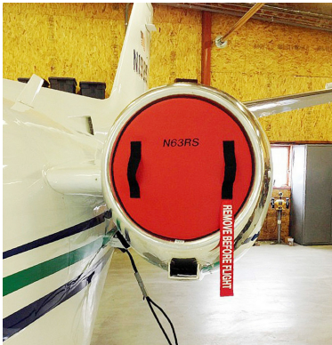
Cessna Citation S2 Intake Plugs