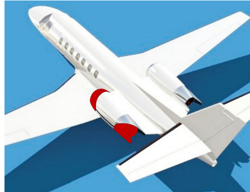
Cessna Citation II with TR's Exhaust Cover Illustration