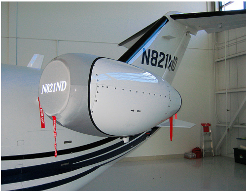
Cessna 510 Mustang Bikini Type Engine Cover