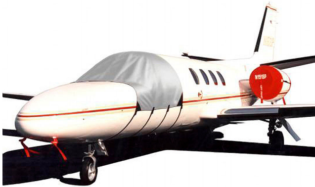
Citation Windshield Cover, Engine Cover set and Pitot Covers

The Engine Inlet Plugs are custom fit for your Cessna Citationjet V Ultra (560) intakes, made with heavy-duty vinyl material, and stuffed with a single block of sculpted urethane foam. Each plug has a zipper that allows the foam to be removed and dried if necessary. Engine plugs have 'remove before flight' streamers sewn onto the face of the plugs. Most plugs are imprinted with the aircraft registration number in black for an extra charge. Storage bag NOT included. Engine plugs may be inserted after flight when the engine is still warm. Engine Inlet Plugs are commonly referred to as Cowl Plugs, Intake Plugs, Cowl Blocks, Engine Blocks, and Engine Bungs.