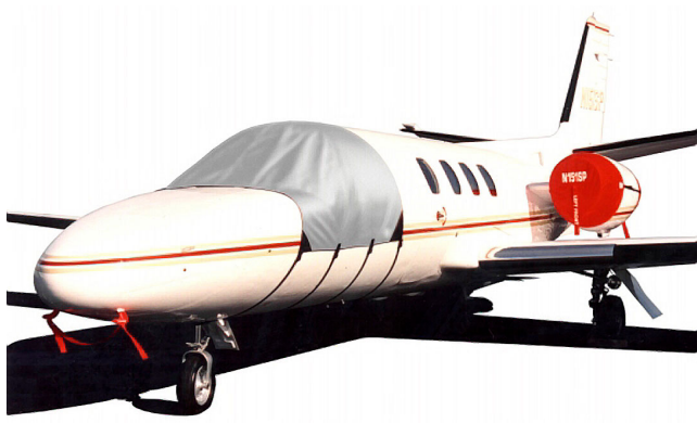
Cessna Citation Windshield Cover, Engine Cover set and Pitot Covers