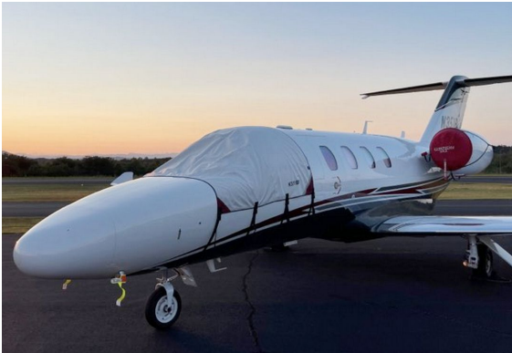
Cessna Citation Jet 525 Cockpit Cover

This cover type is made from Silver Acrylic Sunbrella canvas and is 100% lined with a soft and smooth microfiber. Bruce's Custom Covers developed this material combination especially for aircraft protection. The outer material is medium weight and treated for water resistance, UV resistance and anti-static buildup. The inner lining is a very soft and smooth microfiber to prevent scratching. The material is very reflective, and tests show that the cabin interior temperature can be reduced to near-ambient temperature on the hottest of days. It is water, ice and snow repellent, yet breathable to allow moisture to escape from between the cover and the aircraft surface.