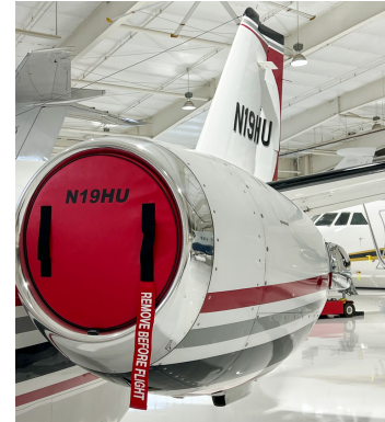
Cessna Citationjet V Ultra (560) Exhaust Plugs