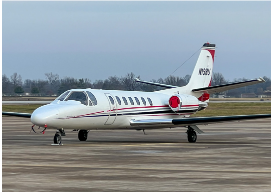
Citationjet V Ultra (560) Exhaust Plugs (set of 2)

The Engine Inlet Plugs are custom fit for your Cessna Citationjet V Ultra & Encore Models intakes, made with heavy-duty vinyl material, and stuffed with a single block of sculpted urethane foam. Each plug has a zipper that allows the foam to be removed and dried if necessary. Engine plugs have 'remove before flight' streamers sewn onto the face of the plugs. Most plugs are imprinted with the aircraft registration number in black for an extra charge. Storage bag NOT included. Engine plugs may be inserted after flight when the engine is still warm. Engine Inlet Plugs are commonly referred to as Cowl Plugs, Intake Plugs, Cowl Blocks, Engine Blocks, and Engine Bungs.