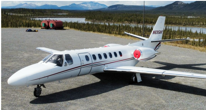
Cessna Citationjet V Ultra (560) Intake Plugs, With Pylon Plugs

The Engine Inlet Plugs are custom fit for your Cessna Citationjet V Ultra & Encore Models intakes, made with heavy-duty vinyl material, and stuffed with a single block of sculpted urethane foam. Each plug has a zipper that allows the foam to be removed and dried if necessary. Engine plugs have 'remove before flight' streamers sewn onto the face of the plugs. Most plugs are imprinted with the aircraft registration number in black for an extra charge. Storage bag NOT included. Engine plugs may be inserted after flight when the engine is still warm. Engine Inlet Plugs are commonly referred to as Cowl Plugs, Intake Plugs, Cowl Blocks, Engine Blocks, and Engine Bung.