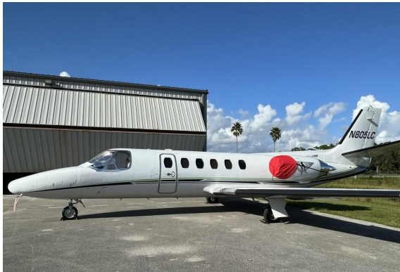
Cessna Citation 550 Intake Cover

The Cessna Citation II (550, 551, UC-35A, with JT15D) Intake Covers are designed to install easily yet be completely storable. A spring steel hoop is sewn into the hem of each cover, allowing them to be installed without climbing onto the wing or using a stepladder. To store the covers the spring steel hoop folds like a band-saw blade into three nesting rings. Each cover folds into a compact circular bundle which is stored in the included duffel bag, yet they unfold quickly for use. The Tri-Fold Ring cover is made of medium weight nylon which is available in a variety of colors to match the paint trim. Each cover set comes complete with installation and folding instructions. The aircraft's registration number can be silkscreened onto the cover for an extra charge.