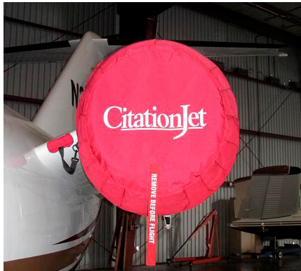
Citation Engine Cover Set

The Cessna Citation II (550, 551, UC-35A, with JT15D) Intake Covers are designed to install easily yet be completely storable. A spring steel hoop is sewn into the hem of each cover, allowing them to be installed without climbing onto the wing or using a stepladder. To store the covers the spring steel hoop folds like a band-saw blade into three nesting rings. Each cover folds into a compact circular bundle which is stored in the included duffle bag, yet they unfold quickly for use. The Tri-Fold Ring cover is made of medium weight nylon which is available in a variety of colors to match the paint trim. Each cover set comes complete with installation and folding instructions. The aircraft's registration number can be silkscreened onto the cover for an extra charge.