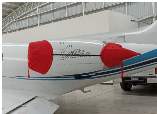
Cessna 551 Citation II SP Engine covers (with thrust reversers, smooth gen. inlet)