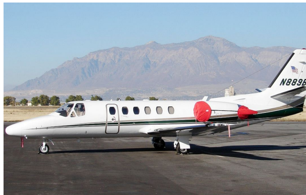
Citation Bravo Tri-Fold Engine Covers