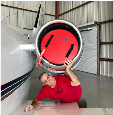
Citation II Engine Plugs

The Engine Inlet Plugs are custom fit for your Cessna Citation II (550, 551, UC-35A, with JT15D) intakes, made with heavy-duty vinyl material, and stuffed with a single block of sculpted urethane foam. Each plug has a zipper that allows the foam to be removed and dried if necessary. Engine plugs have 'remove before flight' streamers sewn onto the face of the plugs. Most plugs are imprinted with the aircraft registration number in black for an extra charge. Storage bag NOT included. Engine plugs may be inserted after flight when the engine is still warm. Engine Inlet Plugs are commonly referred to as Cowl Plugs, Intake Plugs, Cowl Blocks, Engine Blocks, and Engine Bungs.