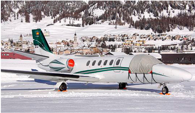
Cessna Citation 550 Windshield Cover