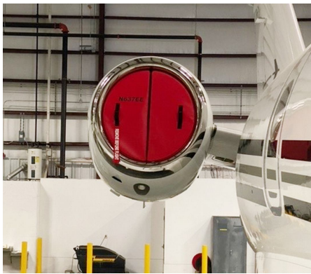
Embraer Legacy 500 Engine Inlet Plugs, folding type

The Engine Inlet Plugs are custom fit for your Cessna Citation II (550, 551, UC-35A, with JT15D) intakes, made with heavy-duty vinyl material, and stuffed with a single block of sculpted urethane foam. Each plug has a zipper that allows the foam to be removed and dried if necessary. Engine plugs have 'remove before flight' streamers sewn onto the face of the plugs. Most plugs are imprinted with the aircraft registration number in black for an extra charge. Storage bag NOT included. Engine plugs may be inserted after flight when the engine is still warm. Engine Inlet Plugs are commonly referred to as Cowl Plugs, Intake Plugs, Cowl Blocks, Engine Blocks, and Engine Bungs.