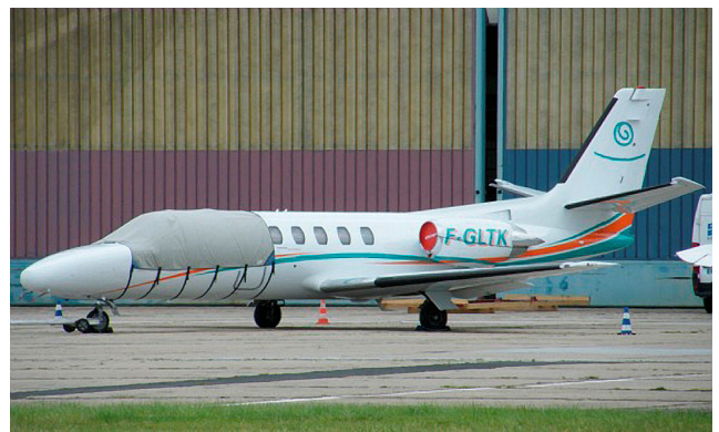
Citation Windshield Cover, to back of door