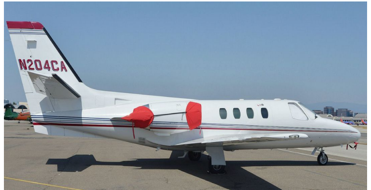
Cessna Citation Engine Covers and Heatshields