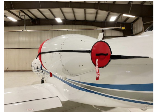
Cessna 510 Engine Inlet Covers & Exhaust Plugs