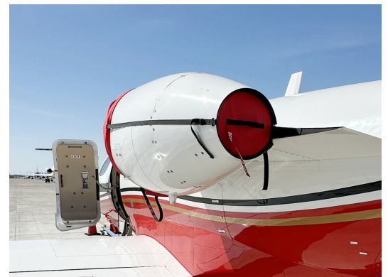
Cessna Citation Mustang 510 Intake Cover/Exhaust Plug Set