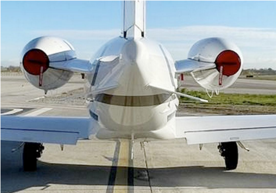
Cessna Mustang Exhaust Plugs

The Cessna Mustang 510 Intake/Exhaust Plugs are custom fit for the intake and exhaust openings, made with heavy-duty vinyl material, and stuffed with a single block of sculpted urethane foam. Each plug has a zipper that allows the foam to be removed and dried if necessary. Engine plugs have 'remove before flight' streamers sewn onto the face of the plugs. Most plugs are imprinted with the aircraft registration number in black. Engine plugs may be inserted after flight when the engine is still warm. Engine Inlet Plugs are commonly referred to as Cowl Plugs, Intake Plugs, Cowl Blocks, Engine Blocks, and Engine Bungs.