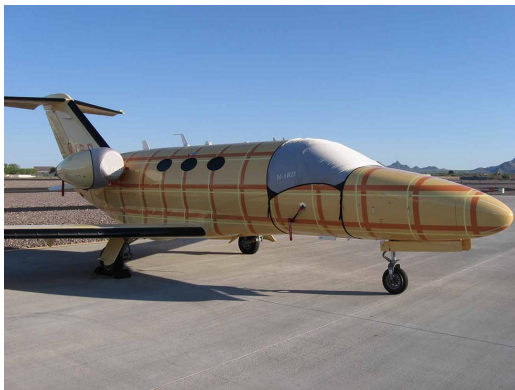
Citation Mustang Light Weight Windshield & Engine Covers

This cover type is made from Silver Acrylic Sunbrella canvas and is 100% lined with a soft and smooth microfiber. Bruce's Custom Covers developed this material combination especially for aircraft protection. The outer material is medium weight and treated for water resistance, UV resistance and anti-static buildup. The inner lining is a very soft and smooth microfiber to prevent scratching. The material is very reflective, and tests show that the cabin interior temperature can be reduced to near-ambient temperature on the hottest of days. It is water, ice and snow repellent, yet breathable to allow moisture to escape from between the cover and the aircraft surface.