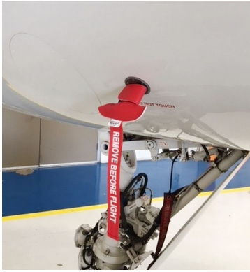
Grumman Gulfstream G-V Rosemont/TAT Cover

Designed to prevent damage to the aircraft extremities in crowded hangars, these products are made of bright red Naugahyde and thickly padded with a sandwich of closed cell foam.