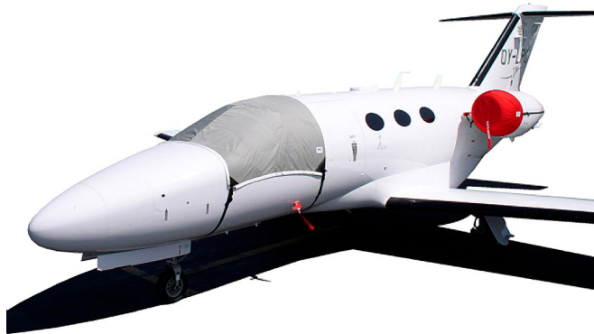
Citation Mustang Windshield Cover, Intake Cover/Exhaust Plug Set, Pitot Covers

The Cessna Mustang 510 Intake/Exhaust Plugs are custom fit for the intake and exhaust openings, made with heavy-duty vinyl material, and stuffed with a single block of sculpted urethane foam. Each plug has a zipper that allows the foam to be removed and dried if necessary. Engine plugs have 'remove before flight' streamers sewn onto the face of the plugs. Most plugs are imprinted with the aircraft registration number in black. Engine plugs may be inserted after flight when the engine is still warm. Engine Inlet Plugs are commonly referred to as Cowl Plugs, Intake Plugs, Cowl Blocks, Engine Blocks, and Engine Bungs.