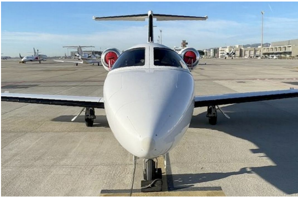
Cessna Mustang Engine Inlet Plugs

The Engine Inlet Plugs are custom fit for your Cessna Mustang 510 intakes, made with heavy-duty vinyl material, and stuffed with a single block of sculpted urethane foam. Each plug has a zipper that allows the foam to be removed and dried if necessary. Engine plugs have 'remove before flight' streamers sewn onto the face of the plugs. Most plugs are imprinted with the aircraft registration number in black for an extra charge. Storage bag NOT included. Engine plugs may be inserted after flight when the engine is still warm. Engine Inlet Plugs are commonly referred to as Cowl Plugs, Intake Plugs, Cowl Blocks, Engine Blocks, and Engine Bungs.