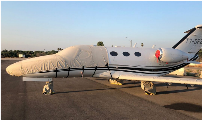
Cessna 510 Mustang Cockpit/Nose Cover, Engine Inlet Plugs