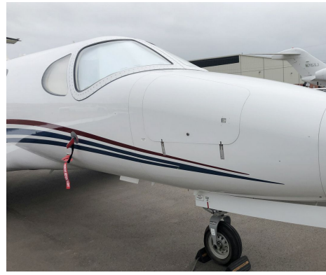
Cessna Mustang 510 Cockpit Heatshields, Pitot Cover/AOA