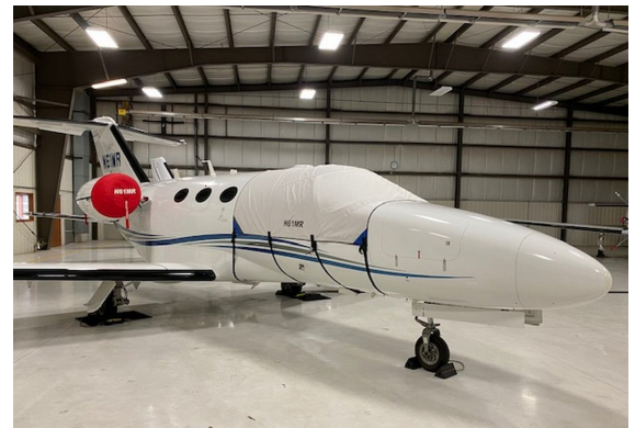
Cessna 510 Cockpit Cover extends to cover door