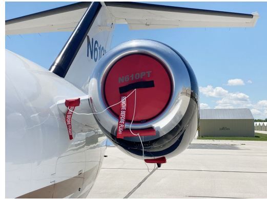
Cessna Citation Mustang 510 Engine Inlet Plugs, set of 8