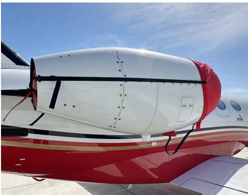
Cessna Citation Mustang 510 Intake Cover/Exhaust Plug Set

The Engine Inlet Plugs are custom fit for your Cessna Mustang 510 intakes, made with heavy-duty vinyl material, and stuffed with a single block of sculpted urethane foam. Each plug has a zipper that allows the foam to be removed and dried if necessary. Engine plugs have 'remove before flight' streamers sewn onto the face of the plugs. Most plugs are imprinted with the aircraft registration number in black for an extra charge. Storage bag NOT included. Engine plugs may be inserted after flight when the engine is still warm. Engine Inlet Plugs are commonly referred to as Cowl Plugs, Intake Plugs, Cowl Blocks, Engine Blocks, and Engine Bungs.