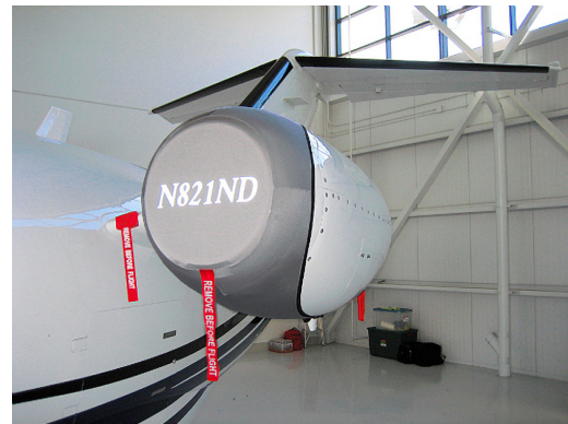
Citation Mustang Intake/Exhaust Cover, "Bikini" Type and leading edge Pylon inlet plugs