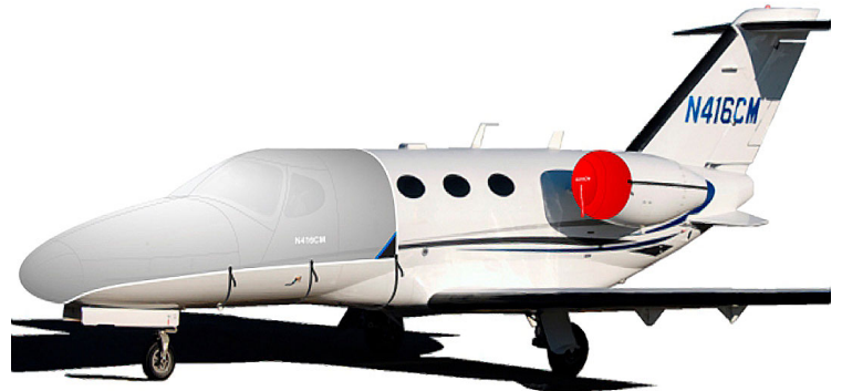
Citation Mustang Windshield Cover, Intake Cover/Exhaust Plug Set, Pitot Covers Citation Mustang Cockpit/Door/Nose Cover, Engine Inlet Cover