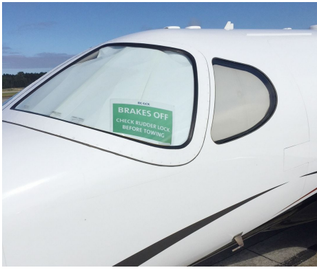
Cessna Mustang 510 Cockpit Heatshields