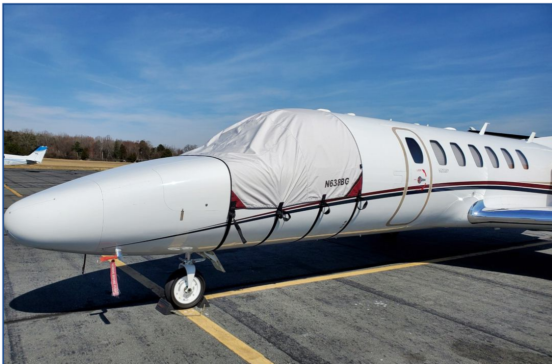
Cessna Citation 560 Cockpit Cover