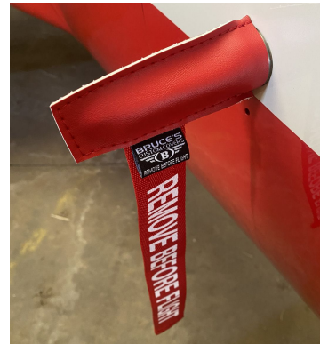
Cessna 501 Angle of Attack Transducer Cover