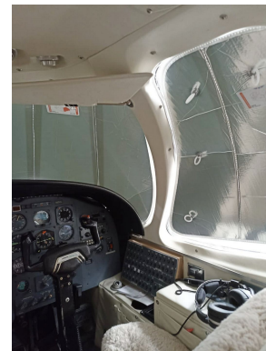
Cessna Citation I & II Cockpit HeatShields