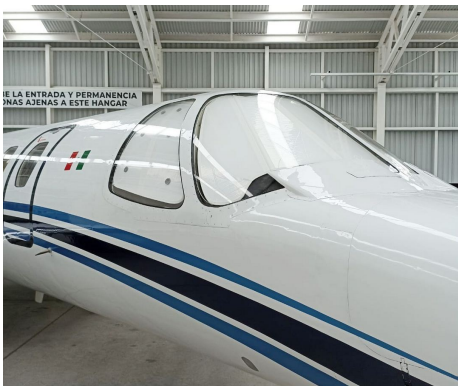
Cessna Citation I & II Cockpit HeatShields

Custom-made Heatshield Sunshades are available for almost any window in the jet. Side windows, Skylights, and Emergency Exits are all custom-made. The product is a unique composite of closed-cell foam with a silver mylar finish. The set is easily stored in the included storage sleeve. Some designs may require velcro and suction cups. Our Heatshields are offered white side out since aircraft manufacturers have issued advisories against reflective window inserts due to potential heat damage.