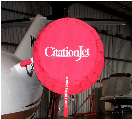
Cessna Citation Engine Cover Set