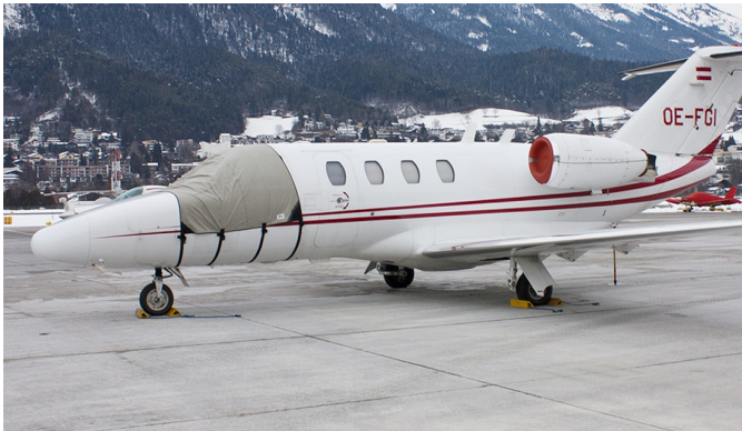
Cessna Citationjet CJ1 Cockpit Cover