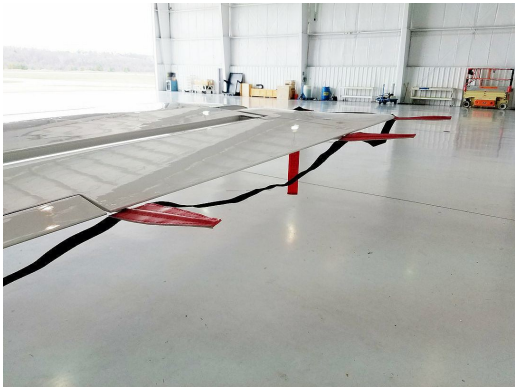
Hawker Beechcraft 800, 800XP, 850XP Static Wick Protectors

The Engine Inlet Plugs are custom fit for your Cessna Citation I (500/501) intakes, made with heavy-duty vinyl material, and stuffed with a single block of sculpted urethane foam. Each plug has a zipper that allows the foam to be removed and dried if necessary. Engine plugs have 'remove before flight' streamers sewn onto the face of the plugs. Most plugs are imprinted with the aircraft registration number in black for an extra charge. Storage bag NOT included. Engine plugs may be inserted after flight when the engine is still warm. Engine Inlet Plugs are commonly referred to as Cowl Plugs, Intake Plugs, Cowl Blocks, Engine Blocks, and Engine Bungs.