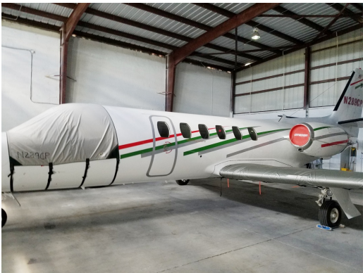
Cessna Citation II Cockpit Cover, Wing Covers