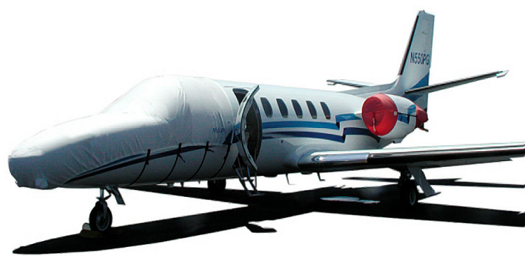
Cessna Citation Nose/Cockpit Cover, Engine Covers

Travel Covers are made with Silver Solution-Dyed Polyester fabric and only lined over the windshield to save weight. The material is lightweight and more compact for easy stowage in the aircraft. The polyester material is water resistant, but only intended for occasional use outside. We also have an ultra lightweight material available for fitted hangar dust covers. For daily outdoor use, the non-travel Sunbrella Cover is the best choice.