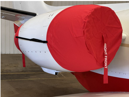
Cessna 501 Engine Covers NO TR's

The Cessna Citation I (500/501) Intake Covers are designed to install easily yet be completely storable. A spring steel hoop is sewn into the hem of each cover, allowing them to be installed without climbing onto the wing or using a stepladder. To store the covers the spring steel hoop folds like a band-saw blade into three nesting rings. Each cover folds into a compact circular bundle which is stored in the included duffle bag, yet they unfold quickly for use. The Tri-Fold Ring cover is made of medium weight nylon which is available in a variety of colors to match the paint trim. Each cover set comes complete with installation and folding instructions. The aircraft's registration number can be silkscreened onto the cover for an extra charge.