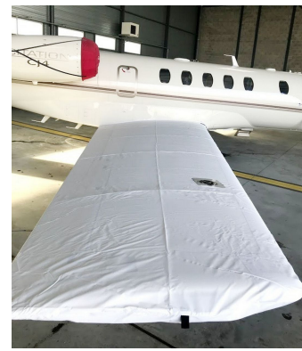
Cessna Citation CJ-4 Wing Covers, test fit cover