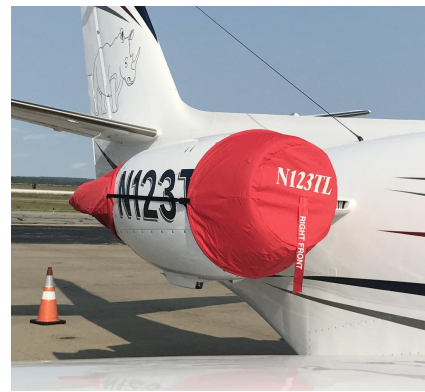
Cessna Citation S/II (S550) Engine Covers (With Tr's)