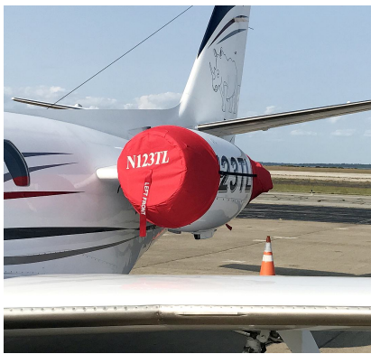
Cessna Citation S/II (S550) Engine Covers (With Tr's)

The Cessna Citation I (500/501) Intake Covers are designed to install easily yet be completely storable. A spring steel hoop is sewn into the hem of each cover, allowing them to be installed without climbing onto the wing or using a stepladder. To store the covers the spring steel hoop folds like a band-saw blade into three nesting rings. Each cover folds into a compact circular bundle which is stored in the included duffle bag, yet they unfold quickly for use. The Tri-Fold Ring cover is made of medium weight nylon which is available in a variety of colors to match the paint trim. Each cover set comes complete with installation and folding instructions. The aircraft's registration number can be silkscreened onto the cover for an extra charge.