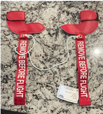
Cessna Citation Pitot Cover Set