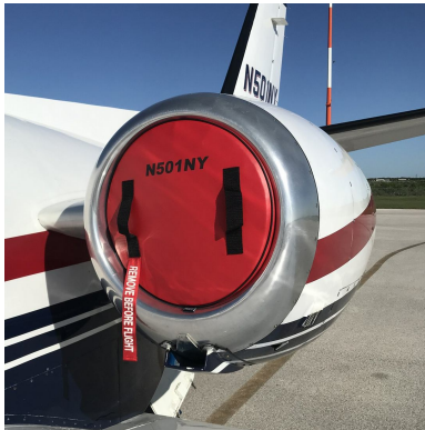
Citation 501 Intake/Exhaust Plug Set

The Engine Inlet Plugs are custom fit for your Cessna Citation I (500/501) intakes, made with heavy-duty vinyl material, and stuffed with a single block of sculpted urethane foam. Each plug has a zipper that allows the foam to be removed and dried if necessary. Engine plugs have 'remove before flight' streamers sewn onto the face of the plugs. Most plugs are imprinted with the aircraft registration number in black for an extra charge. Storage bag NOT included. Engine plugs may be inserted after flight when the engine is still warm. Engine Inlet Plugs are commonly referred to as Cowl Plugs, Intake Plugs, Cowl Blocks, Engine Blocks, and Engine Bungs.