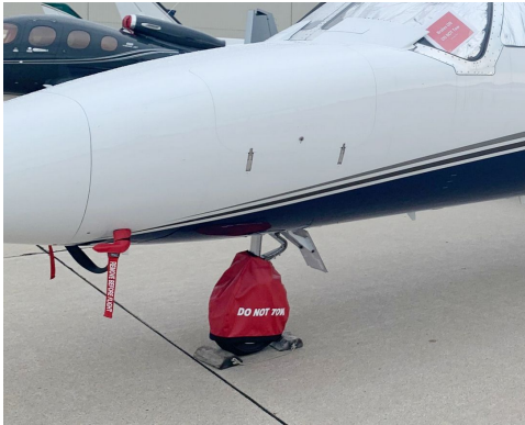
Cessna Citation Nose Tire Cover

ALL-YEAR USE MATERIAL - Made with Silver Acrylic Sunbrella canvas, the all-year use material is the best option for sun protection and cover longevity. This heavier more durable material is intended for all weather conditions, such as rain and snow or lots of sun.