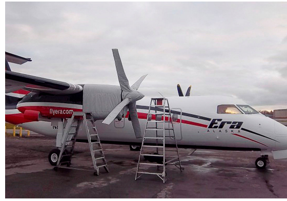
Dash 8 Insulated Engine & Prop Covers