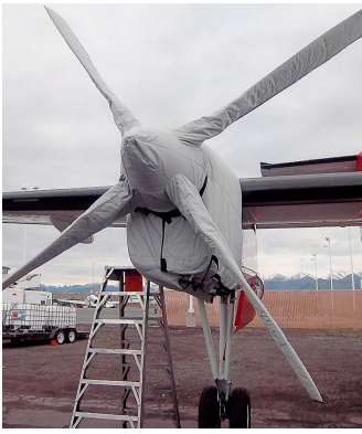
Dash 8 Insulated Engine & Prop Covers