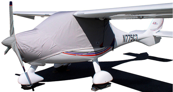
Flight Design CT Canopy/Engine Cover

Travel Covers are made with Silver Solution-Dyed Polyester fabric and only lined over the windshield to save weight. The material is lightweight and more compact for easy stowage in the aircraft. The polyester material is water resistant, but only intended for occasional use outside. We also have an ultra lightweight material available for fitted hangar dust covers. For daily outdoor use, the non-travel Sunbrella Cover is the best choice.