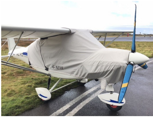
Ikarus C-42 Extended Canopy/Engine Cover