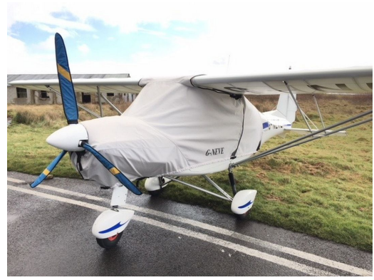
Ikarus C-42 Extended Canopy/Engine Cover