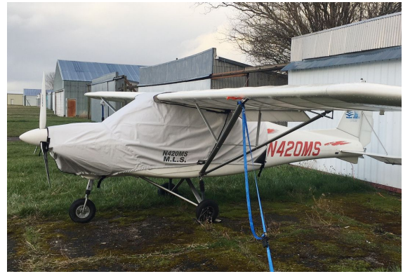
Ikarus C-42 Extended Canopy/Engine Cover