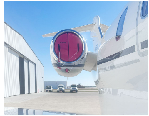
Canadair Challenger 300 Intake Plugs