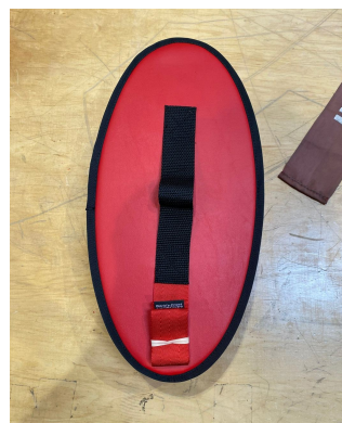
Canadair Challenger 300, 350 APU Exhaust Plug