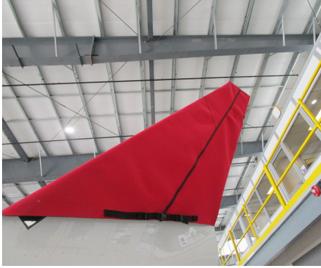
Bombardier Global Express Padded Winglet Covers