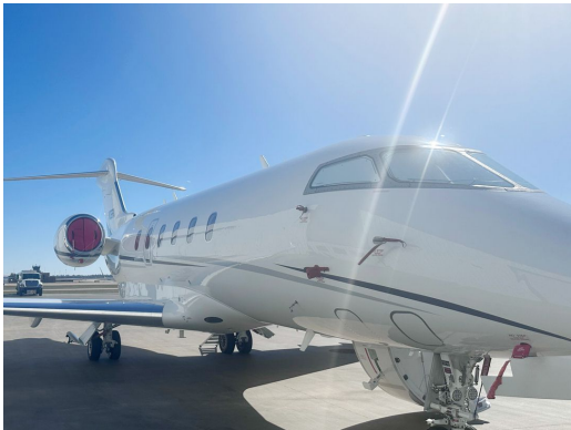
Canadair Challenger 300 Cockpit HeatShields, Intake Plugs