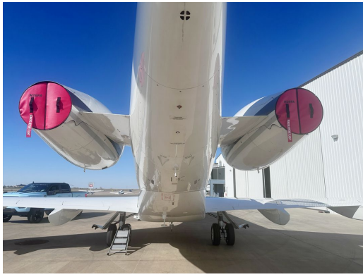
Canadair Challenger 300 Exhaust Plugs