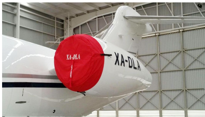
Challenger 300 Intake Covers