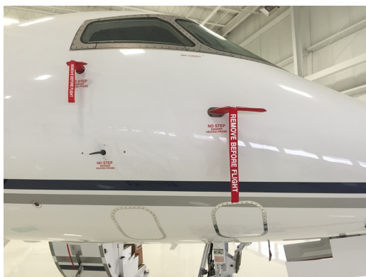
Challenger 300 Pitot Covers