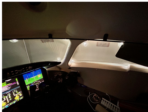
Canadair Challenger 300 Cockpit HeatShields