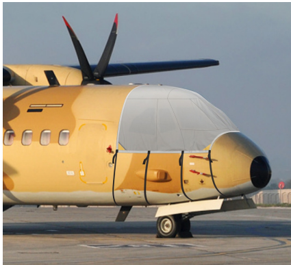
Casa C-295 Cockpit Cover (illustration)

This cover type is made from Silver Acrylic Sunbrella canvas and is 100% lined with a soft and smooth microfiber. Bruce's Custom Covers developed this material combination especially for aircraft protection. The outer material is medium weight and treated for water resistance, UV resistance and anti-static buildup. The inner lining is a very soft and smooth microfiber to prevent scratching. The material is very reflective, and tests show that the cabin interior temperature can be reduced to near-ambient temperature on the hottest of days. It is water, ice and snow repellent, yet breathable to allow moisture to escape from between the cover and the aircraft surface.