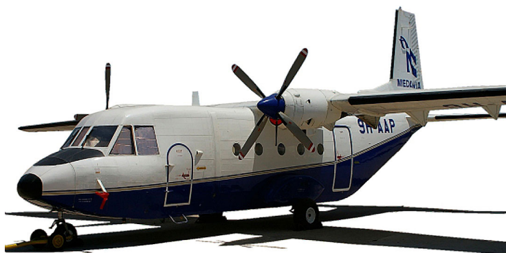
Casa 212 Engine Plugs

Engine Inlet Plugs are custom fit for your Casa/IPTN CN-235 intakes, made with heavy-duty vinyl material, and stuffed with a single block of sculpted urethane foam. Each plug has a zipper that allows the foam to be removed and dried if necessary. Engine plugs have warning flags that are visible from the cockpit or 'remove before flight' streamers sewn onto the face of the plugs. Most plugs are imprinted with the aircraft registration number in black for an extra charge. Storage bag NOT included. Engine plugs may be inserted after flight when the engine is still warm. Engine Inlet Plugs are commonly referred to as Cowl Plugs, Intake Plugs, Cowl Blocks, Engine Blocks, and Engine Bungs.