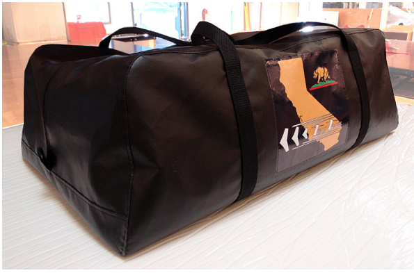
Storage Bag for the Intake Cover Set