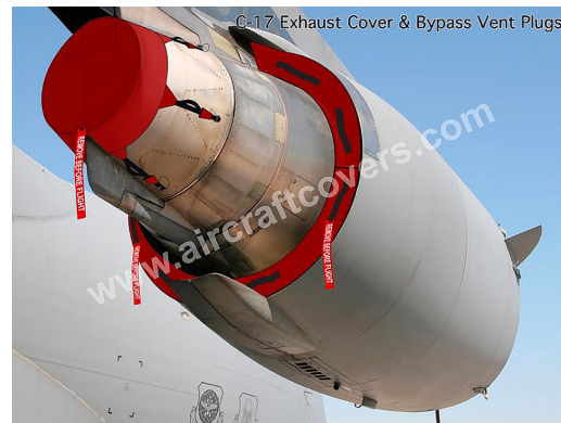
C-17 Globemaster Exhaust Cover and Bypass Vent Plugs, folding type