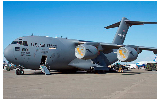
C-17 Engine Intake Covers and Exhaust Covers