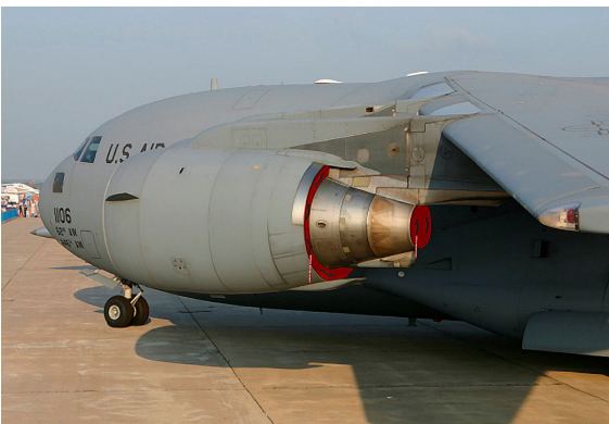
C-17 Bypass and Exhaust Plugs (illustration)

The Engine Inlet Plugs are custom fit for your McDonnell Douglas Globemaster C-17 intakes, made with heavy-duty vinyl material, and stuffed with a single block of sculpted urethane foam. Each plug has a zipper that allows the foam to be removed and dried if necessary. Engine plugs have 'remove before flight' streamers sewn onto the face of the plugs. Most plugs are imprinted with the aircraft registration number in black for an extra charge. Storage bag NOT included. Engine plugs may be inserted after flight when the engine is still warm. Engine Inlet Plugs are commonly referred to as Cowl Plugs, Intake Plugs, Cowl Blocks, Engine Blocks, and Engine Bunges.