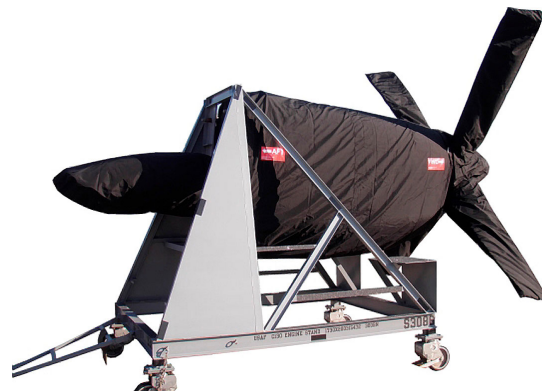
C130 Maintenance Storage Engine, Exhaust, and Prop/Spinner Cover set