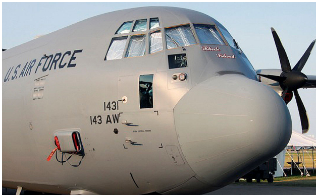
C-130 Cockpit HeatShields

Windshield and Skylight Heatshields are interior sunshades for an aircraft's front windshield and overhead window. The product is a unique composite of closed-cell foam with a silver mylar finish. The semi-rigid design is stiff enough to stand along the inside of the windshield using sun visors or window framing. It folds up flat and easily stores in the included storage sleeve. Some designs may require velcro and suction cups or split right and left sides. A Heatshield is an excellent short-term remedy for cockpit overheating. An external fabric cover is far more effective and practical for long-term protection.