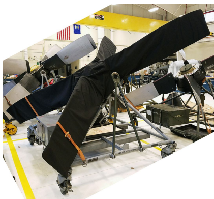
C-130 QEC / Maintenance Cover Set

This cover type is made from Silver Acrylic Sunbrella canvas and is 100% lined with a soft and smooth microfiber. Bruce's Custom Covers developed this material combination especially for aircraft protection. The outer material is medium weight and treated for water resistance, UV resistance and anti-static buildup. The inner lining is a very soft and smooth microfiber to prevent scratching. The material is very reflective, and tests show that the cabin interior temperature can be reduced to near-ambient temperature on the hottest of days. It is water, ice and snow repellent, yet breathable to allow moisture to escape from between the cover and the aircraft surface.