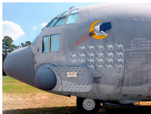
Lockheed AC-130A Flight Deck HeatShield Set