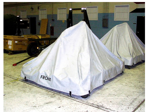
C-130 Prop Stand Covers