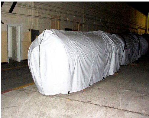
C-130 Aux. Fuel Tank Covers

ALL-YEAR USE MATERIAL - Made with Silver Acrylic Sunbrella canvas, the all-year use material is the best option for sun protection and cover longevity. This heavier more durable material is intended for all weather conditions, such as rain and snow or lots of sun.