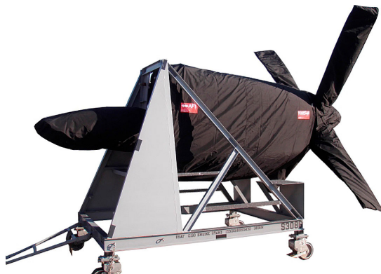
C130 Maintenance Storage Engine, Exhaust, and Prop/Spinner Cover set

This cover type is made from Silver Acrylic Sunbrella canvas and is 100% lined with a soft and smooth microfiber. Bruce's Custom Covers developed this material combination especially for aircraft protection. The outer material is medium weight and treated for water resistance, UV resistance and anti-static buildup. The inner lining is a very soft and smooth microfiber to prevent scratching. The material is very reflective, and tests show that the cabin interior temperature can be reduced to near-ambient temperature on the hottest of days. It is water, ice and snow repellent, yet breathable to allow moisture to escape from between the cover and the aircraft surface.