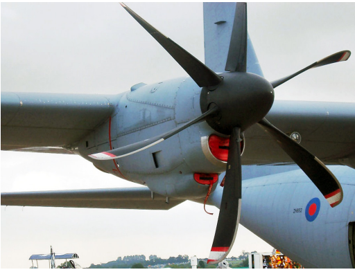
Main and Oil Cooler inlet plugs