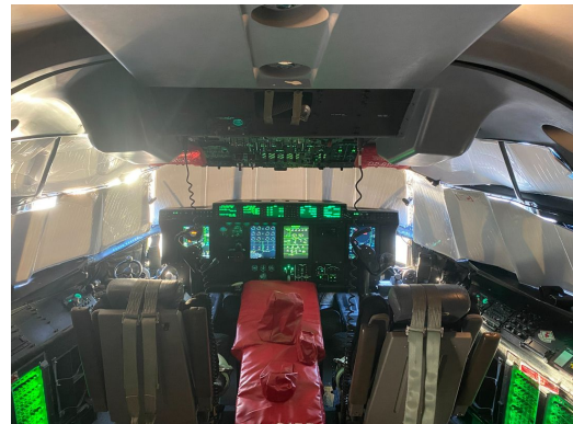
Lookheed C-130 Hercules Flight Deck Heatshield Set