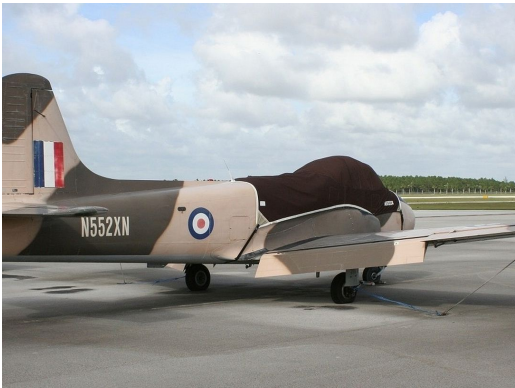
Jet Provost Canopy Cover