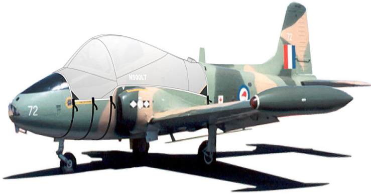
Jet Provost Canopy Cover (Illustration)

Travel Covers are made with Silver Solution-Dyed Polyester fabric and only lined over the windshield to save weight. The material is lightweight and more compact for easy stowage in the aircraft. The polyester material is water resistant, but only intended for occasional use outside. We also have an ultra lightweight material available for fitted hangar dust covers. For daily outdoor use, the non-travel Sunbrella Cover is the best choice.