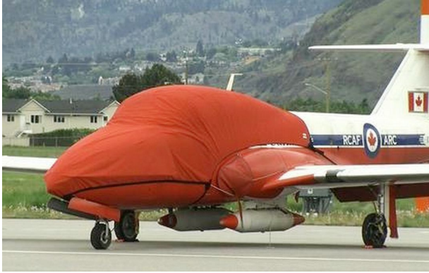
Canadair CT-114 Canopy/Nose Cover

This cover type is made from Silver Acrylic Sunbrella canvas and is 100% lined with a soft and smooth microfiber. Bruce's Custom Covers developed this material combination especially for aircraft protection. The outer material is medium weight and treated for water resistance, UV resistance and anti-static buildup. The inner lining is a very soft and smooth microfiber to prevent scratching. The material is very reflective, and tests show that the cabin interior temperature can be reduced to near-ambient temperature on the hottest of days. It is water, ice and snow repellent, yet breathable to allow moisture to escape from between the cover and the aircraft surface.