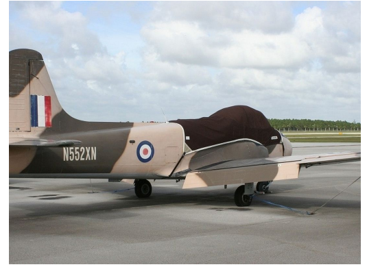
Jet Provost Canopy Cover