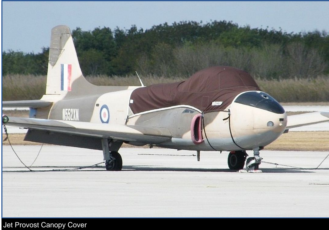
Jet Provost Canopy Cover