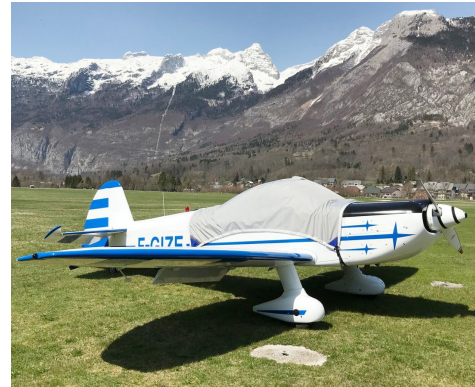
Mudry Cap 10 Canopy Cover