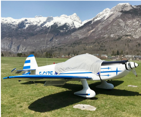
Mudry Cap 10 Canopy Cover

water resistance, UV resistance and anti-static buildup. The inner lining is a very soft and smooth microfiber to prevent scratching. The material is very reflective, and tests show that the cabin interior temperature can be reduced to near-ambient temperature on the hottest of days. It is water, ice and snow repellent, yet breathable to allow moisture to escape from between the cover and the aircraft surface.