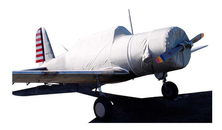
BT-13 Extended Canopy & Engine Covers