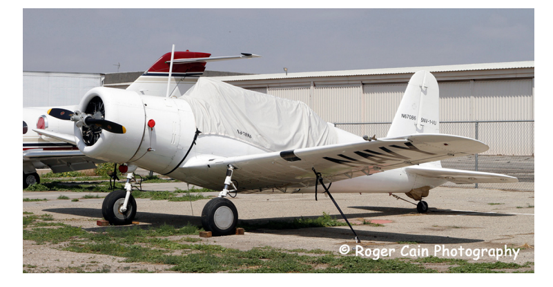
BT-13 Canopy Cover