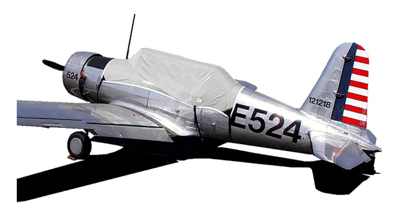
BT-13 Canopy Cover