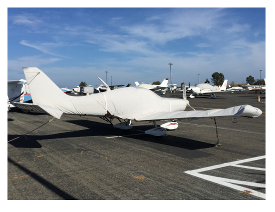
BRM Bristell S-LSA Full Cover Set