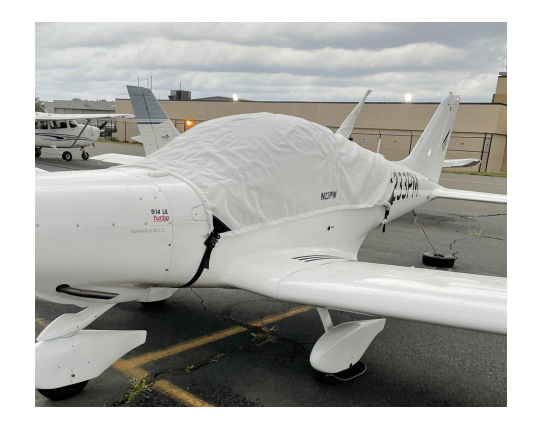
Bristell LSA Canopy Cover