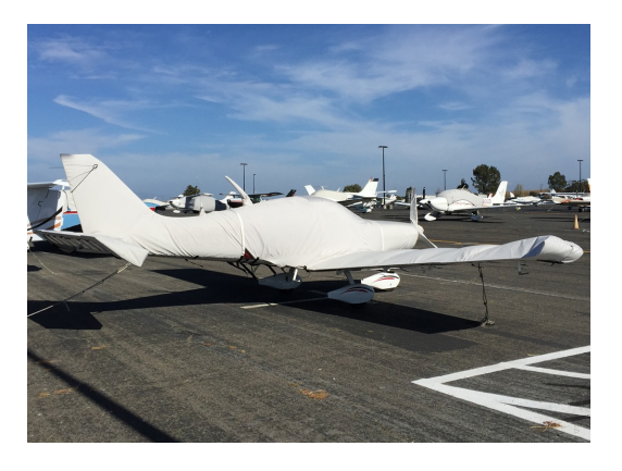
BRM Bristell S-LSA Full Cover Set