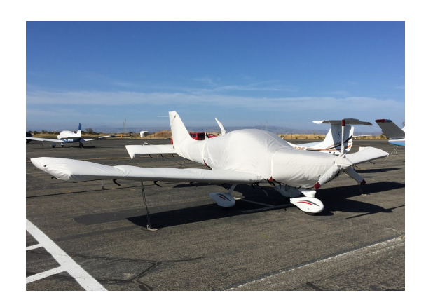
BRM Bristell S-LSA Full Cover Set

This cover type is made from Silver Acrylic Sunbrella canvas and is 100% lined with a soft and smooth microfiber. Bruce's Custom Covers developed this material combination especially for aircraft protection. The outer material is medium weight and treated for water resistance, UV resistance and anti-static buildup. The inner lining is a very soft and smooth microfiber to prevent scratching. The material is very reflective, and tests show that the cabin interior temperature can be reduced to near-ambient temperature on the hottest of days. It is water, ice and snow repellent, yet breathable to allow moisture to escape from between the cover and the aircraft surface.