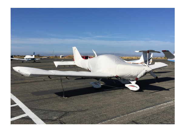
BRM Bristell S-LSA Full Cover Set

This cover type is made from Silver Acrylic Sunbrella canvas and is 100% lined with a soft and smooth microfiber. Bruce's Custom Covers developed this material combination especially for aircraft protection. The outer material is medium weight and treated for water resistance, UV resistance and anti-static buildup. The inner lining is a very soft and smooth microfiber to prevent scratching. The material is very reflective, and tests show that the cabin interior temperature can be reduced to near-ambient temperature on the hottest of days. It is water, ice and snow repellent, yet breathable to allow moisture to escape from between the cover and the aircraft surface.