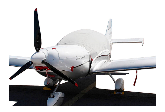
Sportcruiser Canopy Cover & Plugs