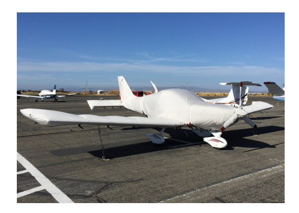
BRM Bristell S-LSA Full Cover Set

WINTER USE MATERIAL - Made with Solution-Dyed Polyester fabric, this option is intended for seasonal use to aid in deicing, rain mitigation, or for occasional travel. The material is lighter and more compact, but more susceptible to UV damage and may have a shorter useful life if used continuously outside than the all-year use material.