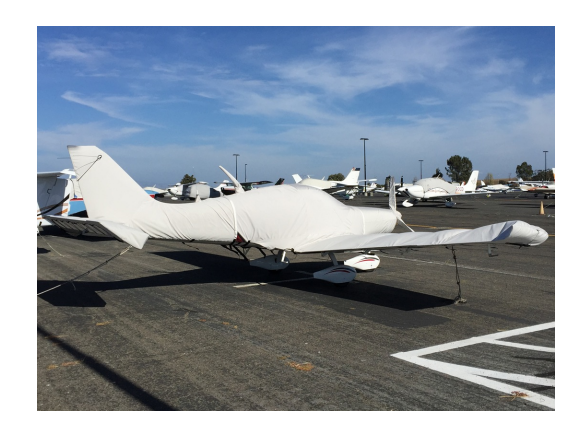
BRM Bristell S-LSA Full Cover Set