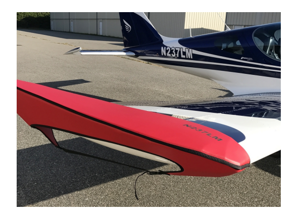
BRM Aero Bristell S-LSA Wingtip Pads

Designed to prevent damage to the aircraft extremities in crowded hangars, these products are made of bright red Naugahyde and thickly padded with a sandwich of closed cell foam.