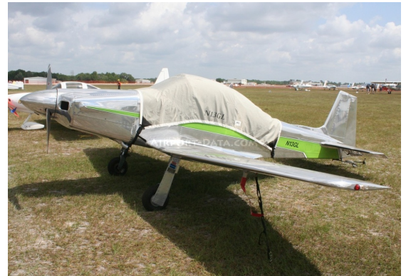
Bushby Mustang Canopy Cover