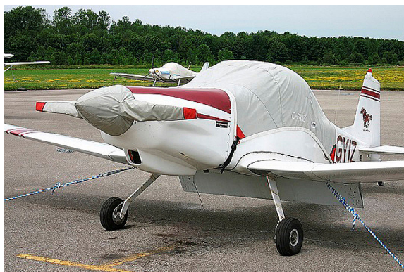
Bushby Mustang Canopy cover and Propellor/Spinner cover