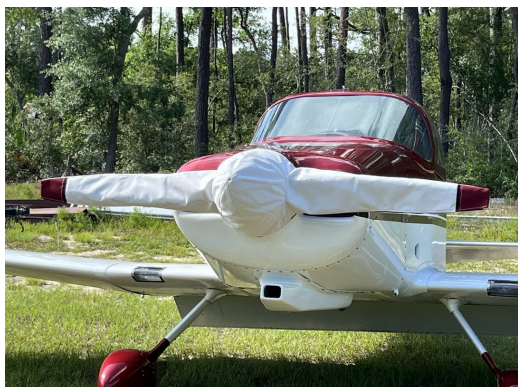
Mustang 2 Prop/Spinner Cover

This cover type is made from Silver Acrylic Sunbrella canvas and is 100% lined with a soft and smooth microfiber. Bruce's Custom Covers developed this material combination especially for aircraft protection. The outer material is medium weight and treated for water resistance, UV resistance and anti-static buildup. The inner lining is a very soft and smooth microfiber to prevent scratching. The material is very reflective, and tests show that the cabin interior temperature can be reduced to near-ambient temperature on the hottest of days. It is water, ice and snow repellent, yet breathable to allow moisture to escape from between the cover and the aircraft surface.