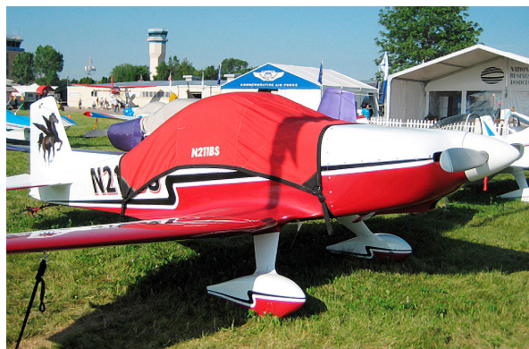
Bushby Mustang Canopy Cover