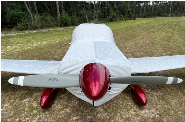
Bushby Mustang Complete Fuselage Cover with Detachable Wing Covers

This cover type is made from Silver Acrylic Sunbrella canvas and is 100% lined with a soft and smooth microfiber. Bruce's Custom Covers developed this material combination especially for aircraft protection. The outer material is medium weight and treated for water resistance, UV resistance and anti-static buildup. The inner lining is a very soft and smooth microfiber to prevent scratching. The material is very reflective, and tests show that the cabin interior temperature can be reduced to near-ambient temperature on the hottest of days. It is water, ice and snow repellent, yet breathable to allow moisture to escape from between the cover and the aircraft surface.