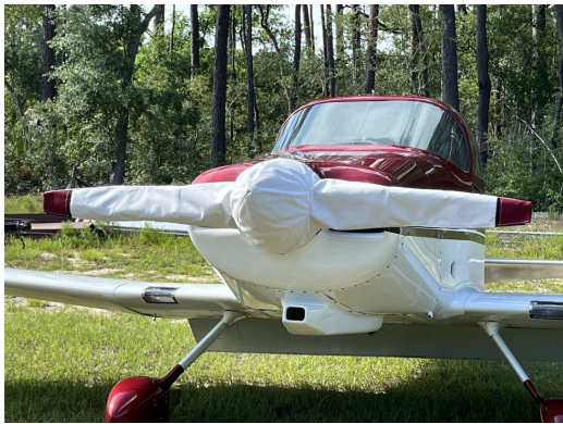
Mustang 2 Prop/Spinner Cover

This cover type is made from Silver Acrylic Sunbrella canvas and is 100% lined with a soft and smooth microfiber. Bruce's Custom Covers developed this material combination especially for aircraft protection. The outer material is medium weight and treated for water resistance, UV resistance and anti-static buildup. The inner lining is a very soft and smooth microfiber to prevent scratching. The material is very reflective, and tests show that the cabin interior temperature can be reduced to near-ambient temperature on the hottest of days. It is water, ice and snow repellent, yet breathable to allow moisture to escape from between the cover and the aircraft surface.