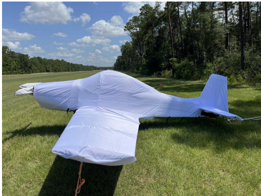
Thorp T-18 & Bushby Mustang Complete Cover, test fit cover

This cover type is made from Silver Acrylic Sunbrella canvas and is 100% lined with a soft and smooth microfiber. Bruce's Custom Covers developed this material combination especially for aircraft protection. The outer material is medium weight and treated for water resistance, UV resistance and anti-static buildup. The inner lining is a very soft and smooth microfiber to prevent scratching. The material is very reflective, and tests show that the cabin interior temperature can be reduced to near-ambient temperature on the hottest of days. It is water, ice and snow repellent, yet breathable to allow moisture to escape from between the cover and the aircraft surface.