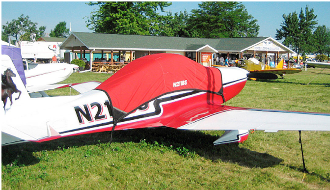
Bushby Mustang Canopy Cover

Travel Covers are made with Silver Solution-Dyed Polyester fabric and only lined over the windshield to save weight. The material is lightweight and more compact for easy stowage in the aircraft. The polyester material is water resistant, but only intended for occasional use outside. We also have an ultra lightweight material available for fitted hangar dust covers. For daily outdoor use, the non-travel Sunbrella Cover is the best choice.