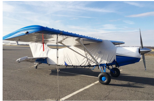
Maule M-5-235C Extended Canopy Cover, Empennage Cover