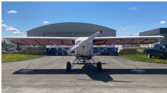
Bearhawk 4-Place Complete Cover Set