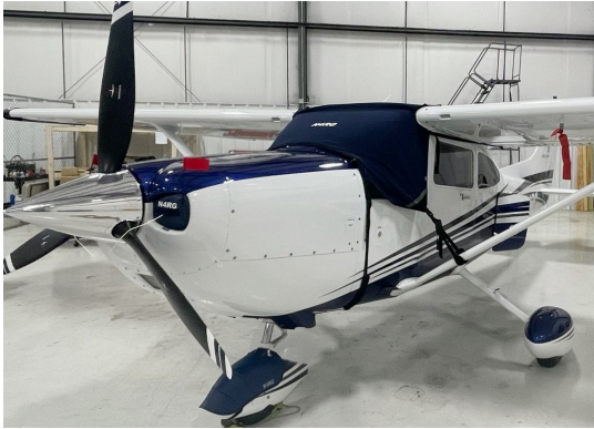
Cessna 182 Windshield Cover, Engine Plugs

This cover type is made from Silver Acrylic Sunbrella canvas and is 100% lined with a soft and smooth microfiber. Bruce's Custom Covers developed this material combination especially for aircraft protection. The outer material is medium weight and treated for water resistance, UV resistance and anti-static buildup. The inner lining is a very soft and smooth microfiber to prevent scratching. The material is very reflective, and tests show that the cabin interior temperature can be reduced to near-ambient temperature on the hottest of days. It is water, ice and snow repellent, yet breathable to allow moisture to escape from between the cover and the aircraft surface.