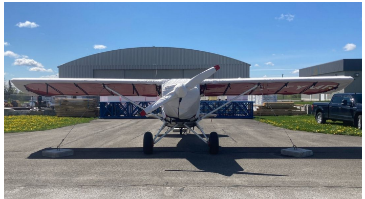
Bearhawk 4-Place Complete Cover Set