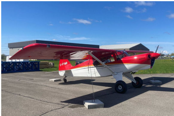
Bearhawk 4-Place Complete Cover Set, BEFORE

WINTER USE MATERIAL - Made with Solution-Dyed Polyester fabric, this option is intended for seasonal use to aid in deicing, rain mitigation, or for occasional travel. The material is lighter and more compact, but more susceptible to UV damage and may have a shorter useful life if used continuously outside than the all-year use material.