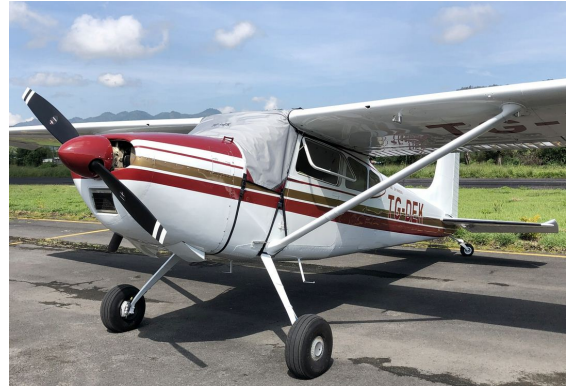
Cessna 180 Windshield Cover