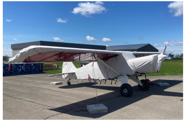
Bearhawk 4-Place Complete Cover Set, AFTER