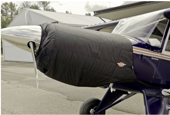
Bearhawk Insulated Engine Cover

This cover type is made from Silver Acrylic Sunbrella canvas and is 100% lined with a soft and smooth microfiber. Bruce's Custom Covers developed this material combination especially for aircraft protection. The outer material is medium weight and treated for water resistance, UV resistance and anti-static buildup. The inner lining is a very soft and smooth microfiber to prevent scratching. The material is very reflective, and tests show that the cabin interior temperature can be reduced to near-ambient temperature on the hottest of days. It is water, ice and snow repellent, yet breathable to allow moisture to escape from between the cover and the aircraft surface.