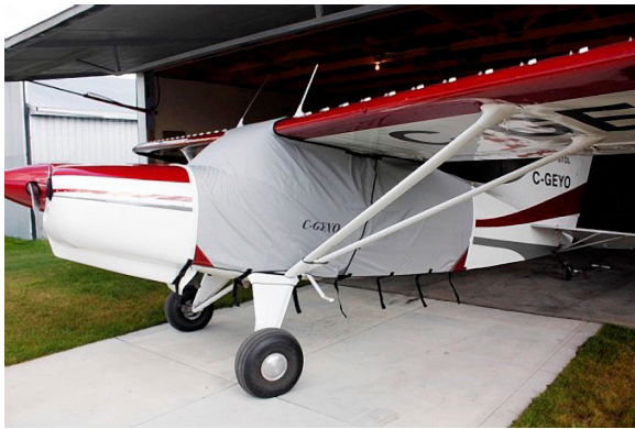
Maule Over-Top Extended Canopy Cover

This cover type is made from Silver Acrylic Sunbrella canvas and is 100% lined with a soft and smooth microfiber. Bruce's Custom Covers developed this material combination especially for aircraft protection. The outer material is medium weight and treated for water resistance, UV resistance and anti-static buildup. The inner lining is a very soft and smooth microfiber to prevent scratching. The material is very reflective, and tests show that the cabin interior temperature can be reduced to near-ambient temperature on the hottest of days. It is water, ice and snow repellent, yet breathable to allow moisture to escape from between the cover and the aircraft surface.