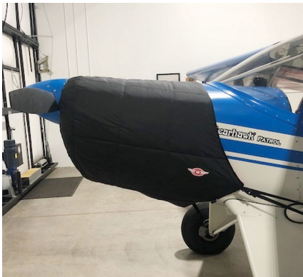
Bearhawk Patrol Insulated Engine Cover

This cover type is made from Silver Acrylic Sunbrella canvas and is 100% lined with a soft and smooth microfiber. Bruce's Custom Covers developed this material combination especially for aircraft protection. The outer material is medium weight and treated for water resistance, UV resistance and anti-static buildup. The inner lining is a very soft and smooth microfiber to prevent scratching. The material is very reflective, and tests show that the cabin interior temperature can be reduced to near-ambient temperature on the hottest of days. It is water, ice and snow repellent, yet breathable to allow moisture to escape from between the cover and the aircraft surface.