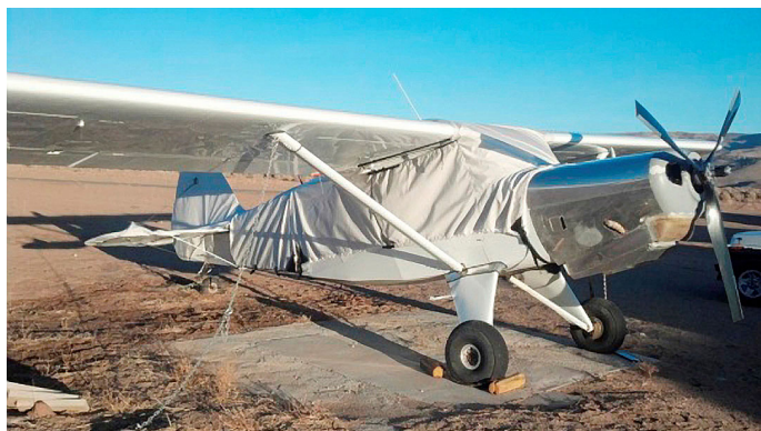
Bearhawk Canopy & Empennage Cover

This cover type is made from Silver Acrylic Sunbrella canvas and is 100% lined with a soft and smooth microfiber. Bruce's Custom Covers developed this material combination especially for aircraft protection. The outer material is medium weight and treated for water resistance, UV resistance and anti-static buildup. The inner lining is a very soft and smooth microfiber to prevent scratching. The material is very reflective, and tests show that the cabin interior temperature can be reduced to near-ambient temperature on the hottest of days. It is water, ice and snow repellent, yet breathable to allow moisture to escape from between the cover and the aircraft surface.