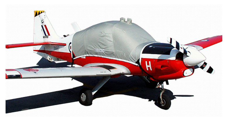
Beagle Pup Canopy Cover