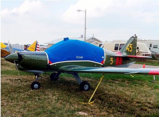
Scottish Aviation Bulldog Canopy Cover