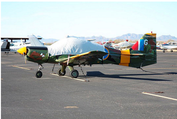
Scottish Aviation Bulldog Canopy Cover

Travel Covers are made with Silver Solution-Dyed Polyester fabric and only lined over the windshield to save weight. The material is lightweight and more compact for easy stowage in the aircraft. The polyester material is water resistant, but only intended for occasional use outside. We also have an ultra lightweight material available for fitted hangar dust covers. For daily outdoor use, the non-travel Sunbrella Cover is the best choice.