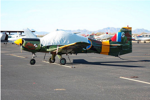
Scottish Aviation Bulldog Canopy Cover

Travel Covers are made with Silver Solution-Dyed Polyester fabric and only lined over the windshield to save weight. The material is lightweight and more compact for easy stowage in the aircraft. The polyester material is water resistant, but only intended for occasional use outside. We also have an ultra lightweight material available for fitted hangar dust covers. For daily outdoor use, the non-travel Sunbrella Cover is the best choice.