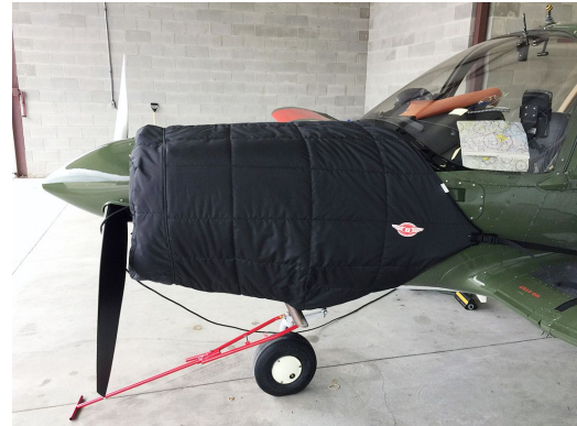
Scottish Aviation Bulldog Insulated Engine Cover