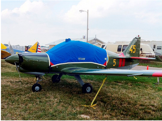
Scottish Aviation Bulldog Canopy Cover

This cover type is made from Silver Acrylic Sunbrella canvas and is 100% lined with a soft and smooth microfiber. Bruce's Custom Covers developed this material combination especially for aircraft protection. The outer material is medium weight and treated for water resistance, UV resistance and anti-static buildup. The inner lining is a very soft and smooth microfiber to prevent scratching. The material is very reflective, and tests show that the cabin interior temperature can be reduced to near-ambient temperature on the hottest of days. It is water, ice and snow repellent, yet breathable to allow moisture to escape from between the cover and the aircraft surface.