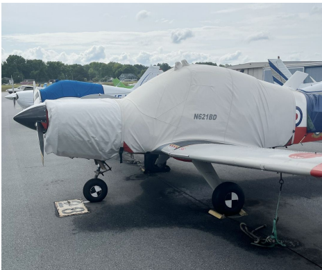
Scottish Aviation Bulldog Canopy & Engine Covers