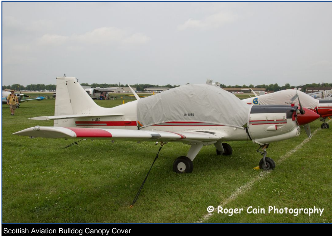
Scottish Aviation Bulldog Canopy Cover