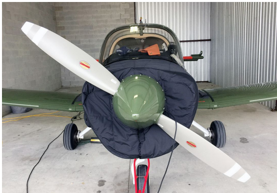
Scottish Aviation Bulldog Insulated Engine Cover

This cover type is made from Silver Acrylic Sunbrella canvas and is 100% lined with a soft and smooth microfiber. Bruce's Custom Covers developed this material combination especially for aircraft protection. The outer material is medium weight and treated for water resistance, UV resistance and anti-static buildup. The inner lining is a very soft and smooth microfiber to prevent scratching. The material is very reflective, and tests show that the cabin interior temperature can be reduced to near-ambient temperature on the hottest of days. It is water, ice and snow repellent, yet breathable to allow moisture to escape from between the cover and the aircraft surface.