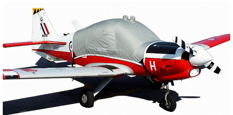
Scottish Aviation Bulldog Canopy Cover