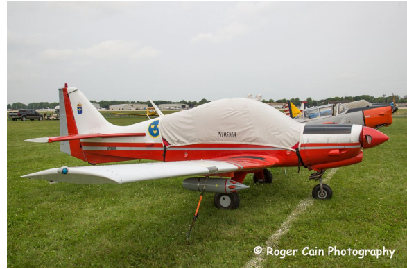
Scottish Aviation Bulldog Canopy Cover