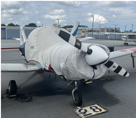
Scottish Aviation Bulldog Canopy & Engine Covers

This cover type is made from Silver Acrylic Sunbrella canvas and is 100% lined with a soft and smooth microfiber. Bruce's Custom Covers developed this material combination especially for aircraft protection. The outer material is medium weight and treated for water resistance, UV resistance and anti-static buildup. The inner lining is a very soft and smooth microfiber to prevent scratching. The material is very reflective, and tests show that the cabin interior temperature can be reduced to near-ambient temperature on the hottest of days. It is water, ice and snow repellent, yet breathable to allow moisture to escape from between the cover and the aircraft surface.