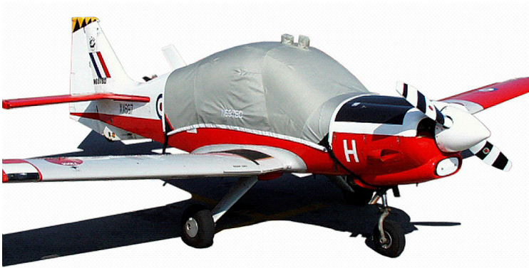
Scottish Aviation Bulldog Canopy Cover