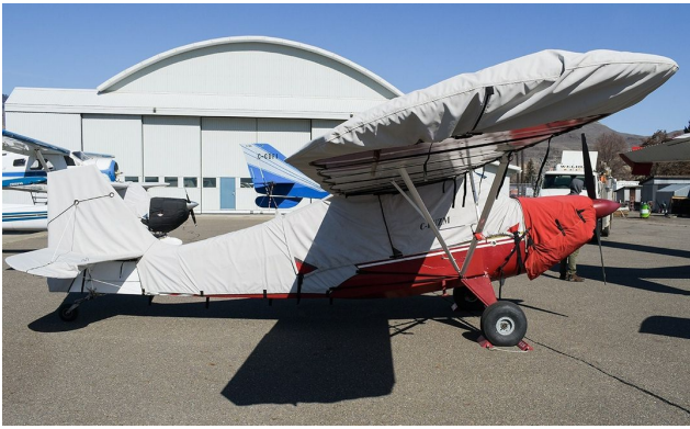
Bellanca Citabria 7ECA Canopy, Empennage & Wing Covers