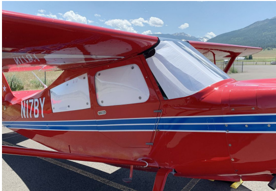
Bellanca Decathlon 8KCAB Heatshield Set with white side out

foam with a silver mylar finish. The semi-rigid design is stiff enough to stand along the inside of the windshield using sun visors or window framing. It folds up flat and easily stores in the included storage sleeve. Some designs may require velcro and suction cups or split right and left sides. A Heatshield is an excellent short-term remedy for cockpit overheating. An external fabric cover is far more effective and practical for long-term protection.