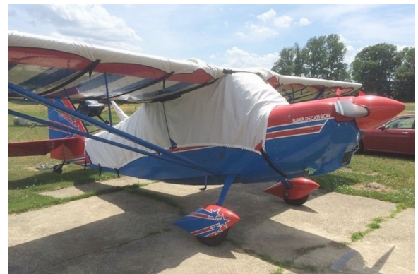
Bellanca Decathlon Canopy Cover (Over-Top, Extended to tail), Wing Covers, Engine Plugs