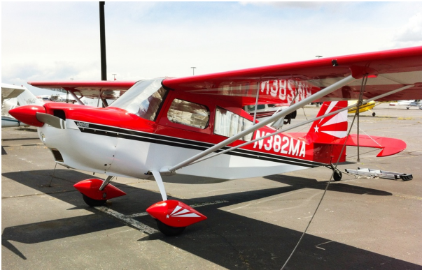
Bellanca Decathlon HeatShield Set