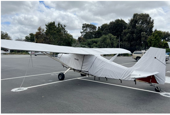
Bellanca Decathlon Full Cover Set