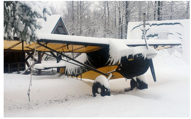
Bellanca 7GCBC Winter Use Cover Set