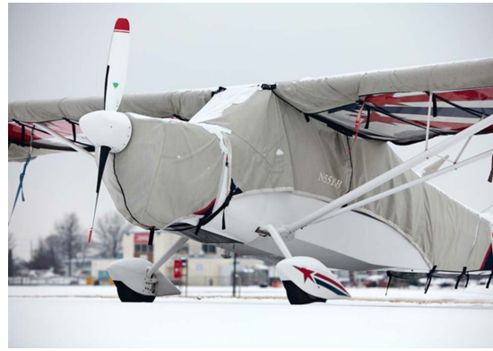
Bellanca Decathlon Canopy Cover (extended aft), Engine & Wing Covers