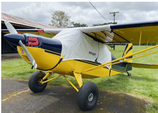
American Champion Citabria canopy cover over the top style, extends to cover gas caps, Engine Plugs

Engine Inlet Plugs are custom fit for your Bellanca (American Champion) Decathlon intakes, made with heavy-duty vinyl material, and stuffed with a single block of sculpted urethane foam. Each plug has a zipper that allows the foam to be removed and dried if necessary. Engine plugs have warning flags that are visible from the cockpit or 'remove before flight' streamers sewn onto the face of the plugs. Most plugs are imprinted with the aircraft registration number in black for an extra charge. Storage bag NOT included. Engine plugs may be inserted after flight when the engine is still warm. Engine Inlet Plugs are commonly referred to as Cowl Plugs, Intake Plugs, Cowl Blocks, Engine Blocks, and Engine Bungs.