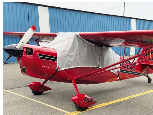
Bellanca (American Champion) Decathlon Travel Cover, Light Weight Canopy Cover Bellanca Decathlon Travel Canopy Cover