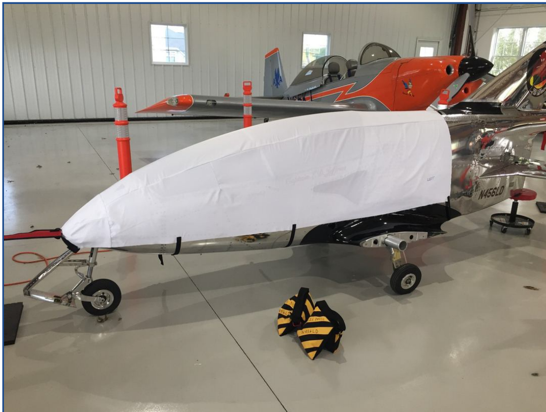
Bede BD-5 Canopy/Nose Cover, test fit cover