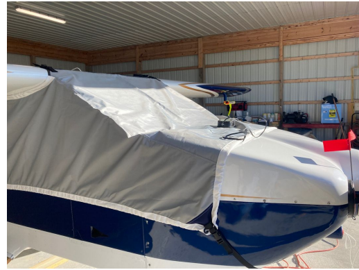
Bede BD-4 Travel Cover, Light Weight Canopy Cover, Wrap-Around