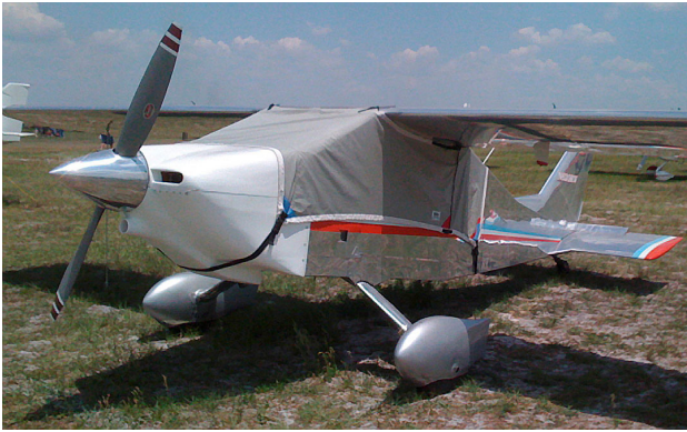
Covers & Plugs for the Bede BD-4

water resistance, UV resistance and anti-static buildup. The inner lining is a very soft and smooth microfiber to prevent scratching. The material is very reflective, and tests show that the cabin interior temperature can be reduced to near-ambient temperature on the hottest of days. It is water, ice and snow repellent, yet breathable to allow moisture to escape from between the cover and the aircraft surface.