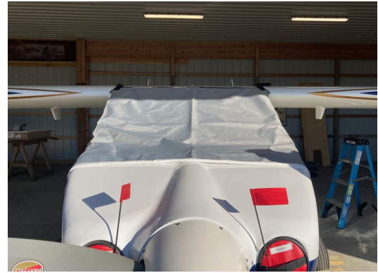
Bede BD-4 Travel Cover, Light Weight Canopy Cover, Wrap-Around