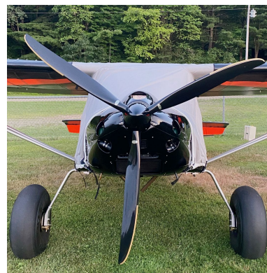
Skyreach Bushcat Travel Weight Canopy Cover