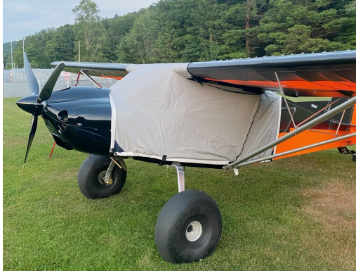
Skyreach Bushcat Travel Weight Canopy Cover

This cover type is made from Silver Acrylic Sunbrella canvas and is 100% lined with a soft and smooth microfiber. Bruce's Custom Covers developed this material combination especially for aircraft protection. The outer material is medium weight and treated for water resistance, UV resistance and anti-static buildup. The inner lining is a very soft and smooth microfiber to prevent scratching. The material is very reflective, and tests show that the cabin interior temperature can be reduced to near-ambient temperature on the hottest of days. It is water, ice and snow repellent, yet breathable to allow moisture to escape from between the cover and the aircraft surface.