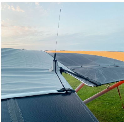
Skyreach Bushcat Travel Weight Canopy Cover

Travel Covers are made with Silver Solution-Dyed Polyester fabric and only lined over the windshield to save weight. The material is lightweight and more compact for easy stowage in the aircraft. The polyester material is water resistant, but only intended for occasional use outside. We also have an ultra lightweight material available for fitted hangar dust covers. For daily outdoor use, the non-travel Sunbrella Cover is the best choice.