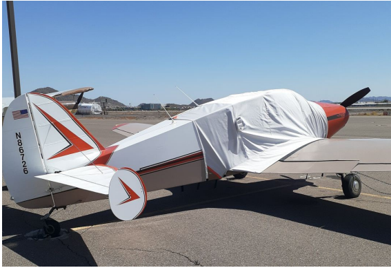
Bellanca 14-13 Cruisair Extended Canopy Cover w/12" Wing Extensions

This cover type is made from Silver Acrylic Sunbrella canvas and is 100% lined with a soft and smooth microfiber. Bruce's Custom Covers developed this material combination especially for aircraft protection. The outer material is medium weight and treated for water resistance, UV resistance and anti-static buildup. The inner lining is a very soft and smooth microfiber to prevent scratching. The material is very reflective, and tests show that the cabin interior temperature can be reduced to near-ambient temperature on the hottest of days. It is water, ice and snow repellent, yet breathable to allow moisture to escape from between the cover and the aircraft surface.