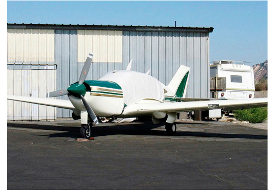
Bellanca Viking Canopy Cover