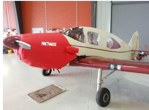
Bellanca Cruisemaster Insulated Engine Cover