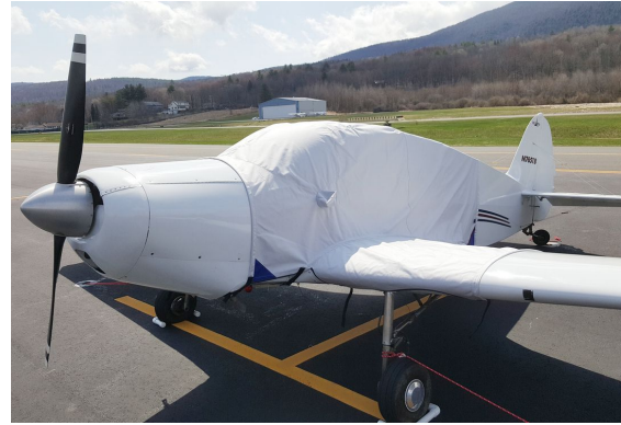
Bellanca Cruisemaster Extended Canopy Cover with 36" Wing Extensions.