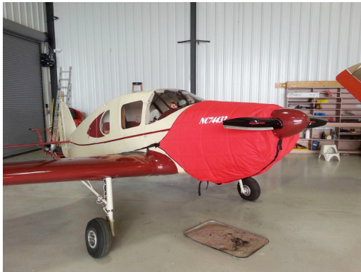
Bellanca Cruisemaster Insulated Engine Cover

This cover type is made from Silver Acrylic Sunbrella canvas and is 100% lined with a soft and smooth microfiber. Bruce's Custom Covers developed this material combination especially for aircraft protection. The outer material is medium weight and treated for water resistance, UV resistance and anti-static buildup. The inner lining is a very soft and smooth microfiber to prevent scratching. The material is very reflective, and tests show that the cabin interior temperature can be reduced to near-ambient temperature on the hottest of days. It is water, ice and snow repellent, yet breathable to allow moisture to escape from between the cover and the aircraft surface.