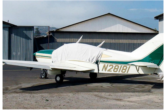
Bellanca Viking Canopy Cover