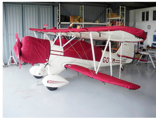
Waco UPF-7 Canopy, Wings, Stab's, Engine, Prop Covers