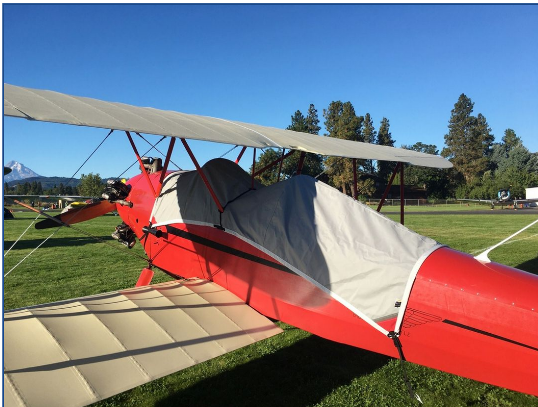
Bird BK Travel Canopy Cover