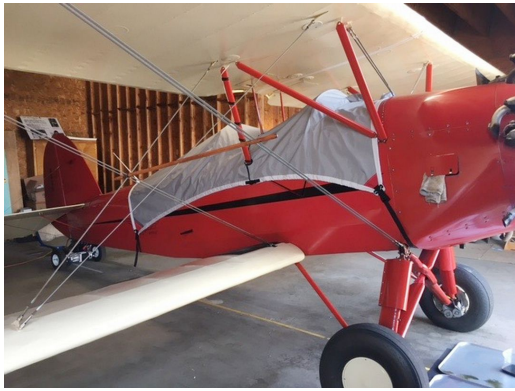
Bird BK Travel Canopy Cover