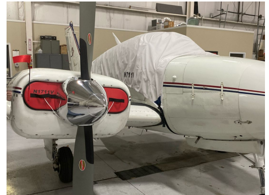
Beech Travel Air Engine Plugs