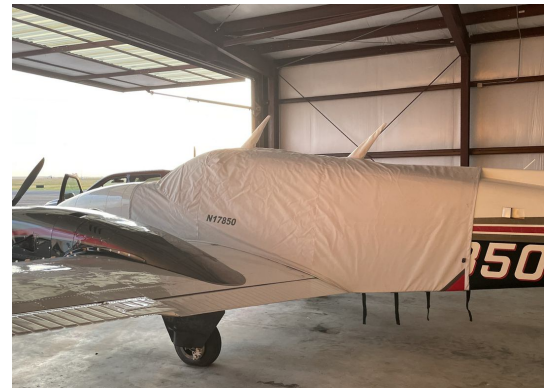
Beech Baron 58TC Extended Canopy Cover