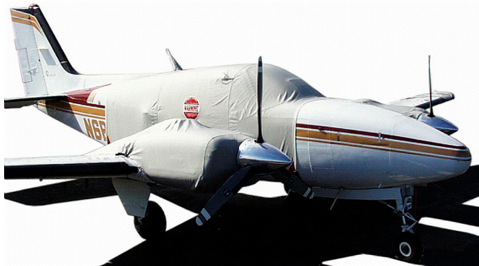
Standard Canopy Cover & Engine Plugs. Extended Canopy Cover & Engine Cover

This cover type is made from Silver Acrylic Sunbrella canvas and is 100% lined with a soft and smooth microfiber. Bruce's Custom Covers developed this material combination especially for aircraft protection. The outer material is medium weight and treated for water resistance, UV resistance and anti-static buildup. The inner lining is a very soft and smooth microfiber to prevent scratching. The material is very reflective, and tests show that the cabin interior temperature can be reduced to near-ambient temperature on the hottest of days. It is water, ice and snow repellent, yet breathable to allow moisture to escape from between the cover and the aircraft surface.