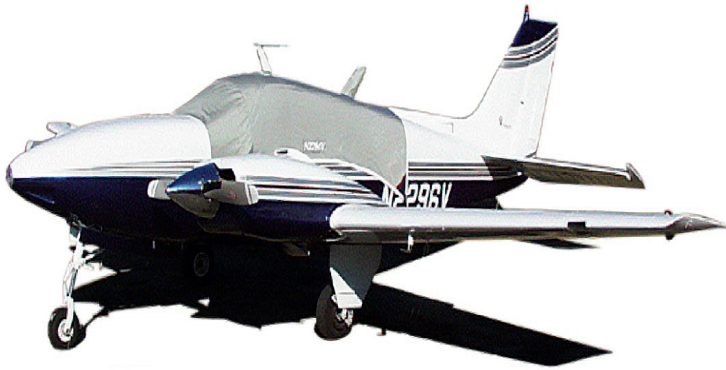
Beech Baron Canopy Cover

This cover type is made from Silver Acrylic Sunbrella canvas and is 100% lined with a soft and smooth microfiber. Bruce's Custom Covers developed this material combination especially for aircraft protection. The outer material is medium weight and treated for water resistance, UV resistance and anti-static buildup. The inner lining is a very soft and smooth microfiber to prevent scratching. The material is very reflective, and tests show that the cabin interior temperature can be reduced to near-ambient temperature on the hottest of days. It is water, ice and snow repellent, yet breathable to allow moisture to escape from between the cover and the aircraft surface.