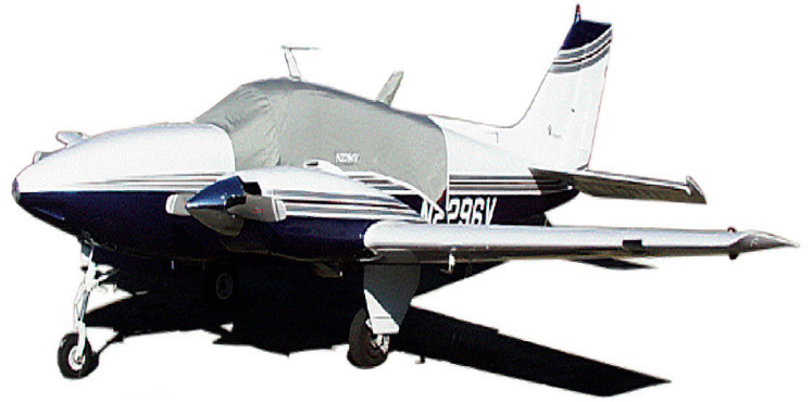
Beech Baron Canopy Cover