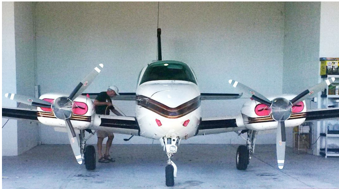
Beech Baron 58 Engine Inlet Plugs, Heater Inlet Plugs

Engine Inlet Plugs are custom fit for your Beech Travel Air B95 intakes, made with heavy-duty vinyl material, and stuffed with a single block of sculpted urethane foam. Each plug has a zipper that allows the foam to be removed and dried if necessary. Engine plugs have warning flags that are visible from the cockpit or 'remove before flight' streamers sewn onto the face of the plugs. Most plugs are imprinted with the aircraft registration number in black for an extra charge. Storage bag NOT included. Engine plugs may be inserted after flight when the engine is still warm. Engine Inlet Plugs are commonly referred to as Cowl Plugs, Intake Plugs, Cowl Blocks, Engine Blocks, and Engine Bungs.