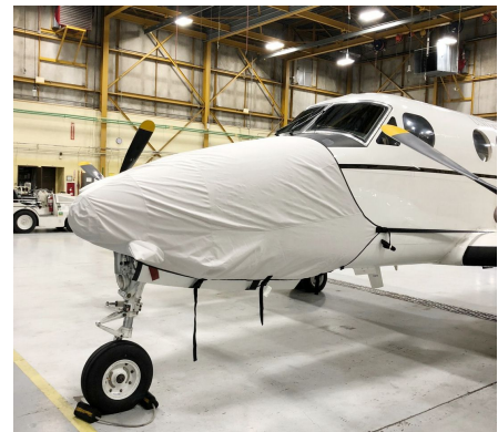
King Air 200 Nose Cover