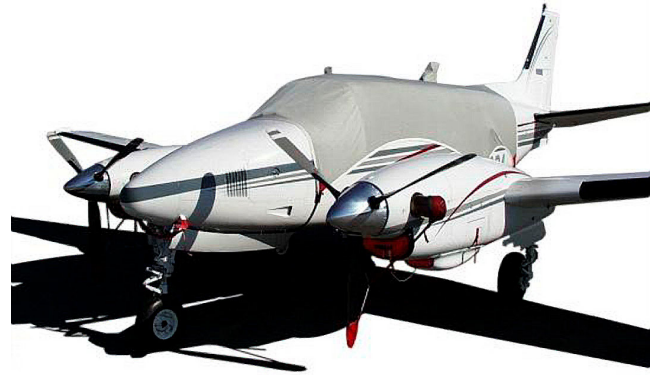
King Air Canopy Cover, Engine Plugs, Prop-Tie/Exhaust Covers