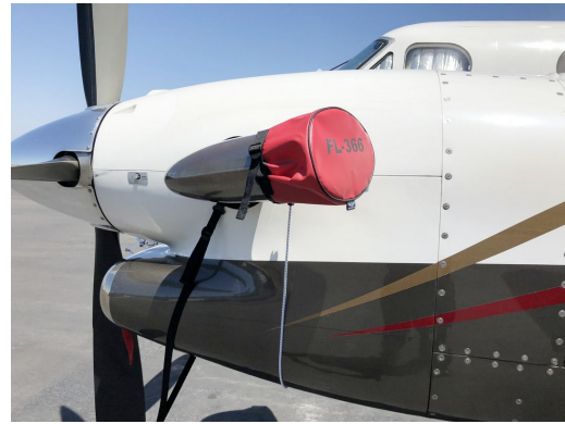
Beech King Air 350 Prop Tie-Downs/Exhaust Covers Combination