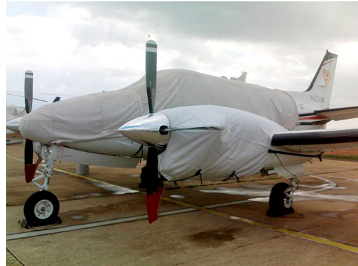
King Air C90 Canopy/Nose Cover, Engine Covers