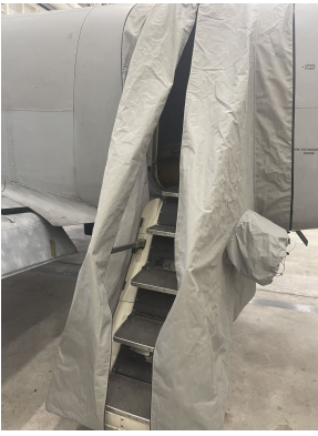
King Air Airstair Coor Cover