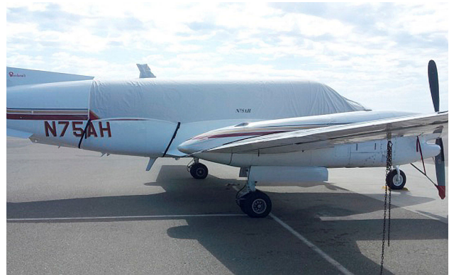
King Air 350 Canopy Cover