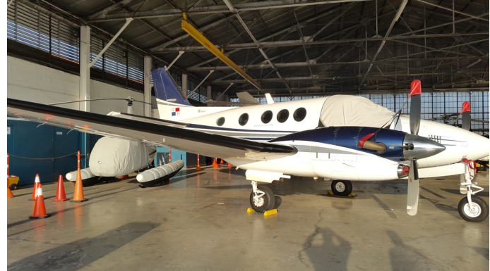
Raytheon Beech King Air Cockpit Cover, Prop Tie/Exhaust Covers, Inlet Plugs