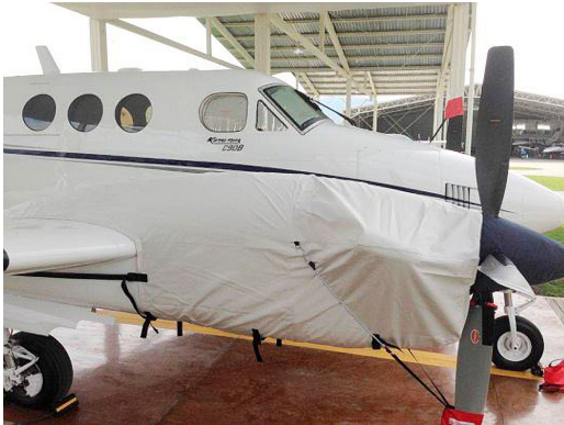
King Air C90 Engine Cover

ALL-YEAR USE MATERIAL - Made with Silver Acrylic Sunbrella canvas, the all-year use material is the best option for sun protection and cover longevity. This heavier more durable material is intended for all weather conditions, such as rain and snow or lots of sun.