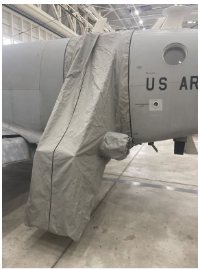
King Air Airstair Coor Cover