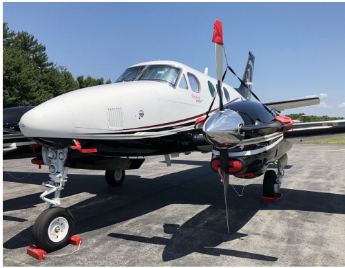
Beech C90A Prop Tie Downs/Exhaust Covers

This cover type is made from Silver Acrylic Sunbrella canvas and is 100% lined with a soft and smooth microfiber. Bruce's Custom Covers developed this material combination especially for aircraft protection. The outer material is medium weight and treated for water resistance, UV resistance and anti-static buildup. The inner lining is a very soft and smooth microfiber to prevent scratching. The material is very reflective, and tests show that the cabin interior temperature can be reduced to near-ambient temperature on the hottest of days. It is water, ice and snow repellent, yet breathable to allow moisture to escape from between the cover and the aircraft surface.