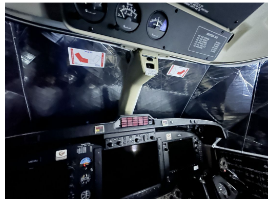
Beechcraft B200 Cockpit Heatshields