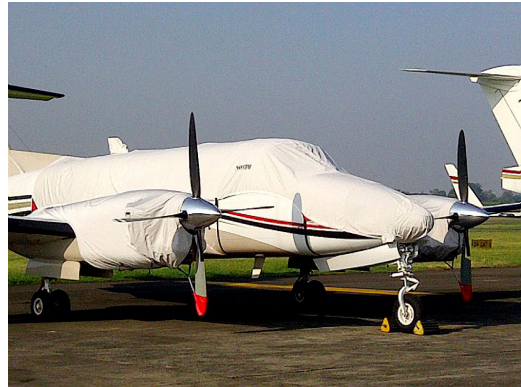
King Air 350 Canopy/Nose Cover, Engine Covers