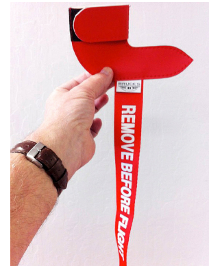
Standard Pitot Cover