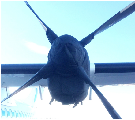
ATR-72-202 Insulated Engine & Prop Hub Covers

This cover type is made from Silver Acrylic Sunbrella canvas and is 100% lined with a soft and smooth microfiber. Bruce's Custom Covers developed this material combination especially for aircraft protection. The outer material is medium weight and treated for water resistance, UV resistance and anti-static buildup. The inner lining is a very soft and smooth microfiber to prevent scratching. The material is very reflective, and tests show that the cabin interior temperature can be reduced to near-ambient temperature on the hottest of days. It is water, ice and snow repellent, yet breathable to allow moisture to escape from between the cover and the aircraft surface.