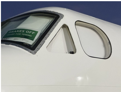
Beechcraft B200 Cockpit Heatshields

Cockpit Heatshields are interior sunshades for the aircraft's cockpit. The product is a unique composite of closed-cell foam with a silver mylar finish. The semi-rigid design is stiff enough to stand inside the window framing. The set folds up flat and is easily stored in the included storage sleeve. Some designs may require velcro and suction cups. A Heatshield is an excellent short-term remedy for cockpit overheating, but an external fabric cover is more effective for long-term protection.