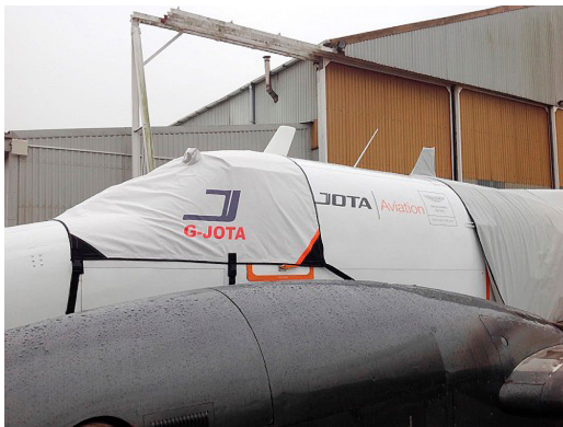
King Air Windshield/Cockpit Cover

This cover type is made from Silver Acrylic Sunbrella canvas and is 100% lined with a soft and smooth microfiber. Bruce's Custom Covers developed this material combination especially for aircraft protection. The outer material is medium weight and treated for water resistance, UV resistance and anti-static buildup. The inner lining is a very soft and smooth microfiber to prevent scratching. The material is very reflective, and tests show that the cabin interior temperature can be reduced to near-ambient temperature on the hottest of days. It is water, ice and snow repellent, yet breathable to allow moisture to escape from between the cover and the aircraft surface.