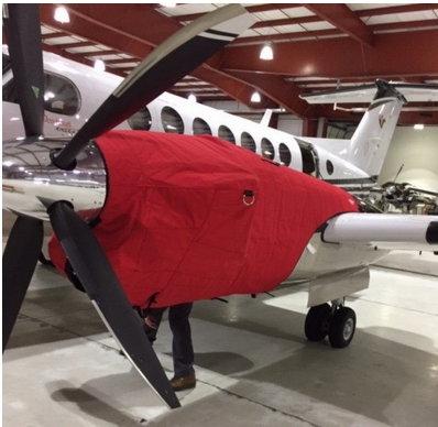
Beech King Air 200 Insulated Engine Cover

This cover type is made from Silver Acrylic Sunbrella canvas and is 100% lined with a soft and smooth microfiber. Bruce's Custom Covers developed this material combination especially for aircraft protection. The outer material is medium weight and treated for water resistance, UV resistance and anti-static buildup. The inner lining is a very soft and smooth microfiber to prevent scratching. The material is very reflective, and tests show that the cabin interior temperature can be reduced to near-ambient temperature on the hottest of days. It is water, ice and snow repellent, yet breathable to allow moisture to escape from between the cover and the aircraft surface.