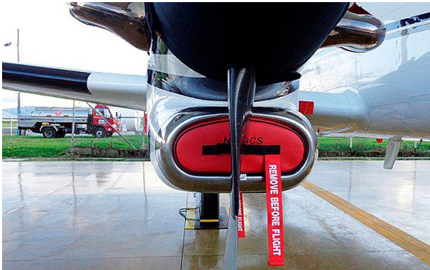
Beech King Air C90B Main Engine Inlet Plug

Engine Inlet Plugs are custom fit for your Beech King Air C90-1 intakes, made with heavy-duty vinyl material, and stuffed with a single block of sculpted urethane foam. Each plug has a zipper that allows the foam to be removed and dried if necessary. Engine plugs have warning flags that are visible from the cockpit or 'remove before flight' streamers sewn onto the face of the plugs. Most plugs are imprinted with the aircraft registration number in black for an extra charge. Storage bag NOT included. Engine plugs may be inserted after flight when the engine is still warm. Engine Inlet Plugs are commonly referred to as Cowl Plugs, Intake Plugs, Cowl Blocks, Engine Blocks, and Engine Bungs.