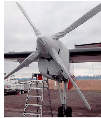
Dash 8 Insulated Engine & Prop Covers