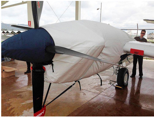
King Air C90 Engine Cover