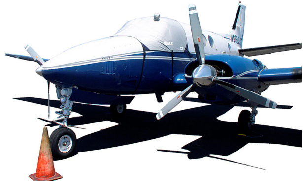
Beech King Air Windshield Cover