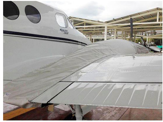
King Air C90 Engine Cover