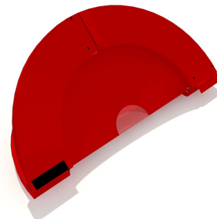
Airbus A330 Intake Plug, framed bi-fold type