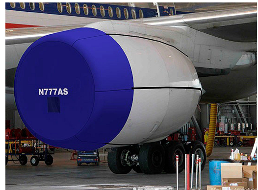
Boeing 777 Intake Cover, GE Engine