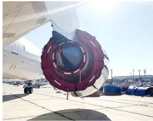
Boeing 787 Dreamliner Bypass Vent, Turbine Exhaust, & Exhaust Nozzle Plugs, Genx Engines