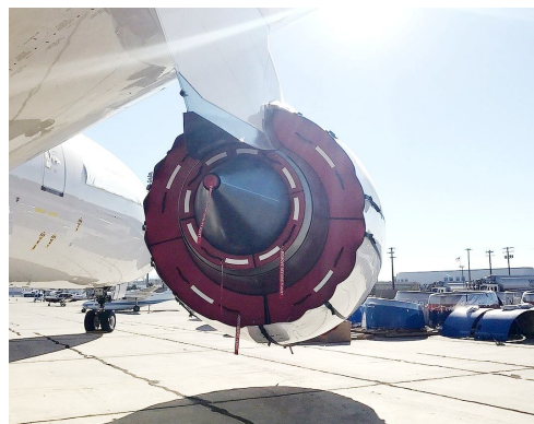
Boeing 787 Dreamliner Bypass Vent, Turbine Exhaust, & Exhaust Nozzle Plugs, Genx Engines