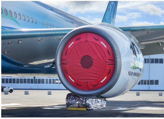
Boeing 777 Intake Plugs, framed, Bi-fold design.