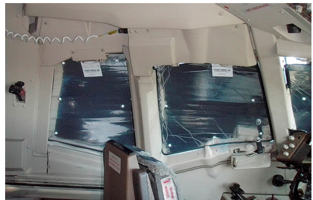
Boeing 767 Cockpit HeatShield set