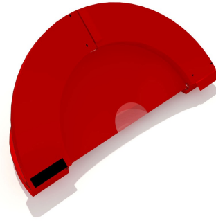
Airbus A330 Intake Plug, framed bi-fold type