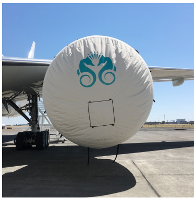
Boeing 777 Intake Covers, GE Engine