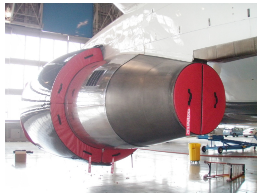
Boeing 787 Intake Plug, framed bi-fold type Exhaust Plugs Ship Set, incl. Fan Thrust Reverser and Exhaust Plugs P/N: B767-200