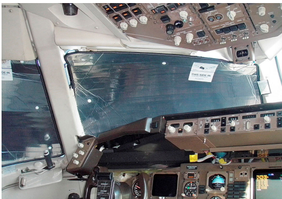
Boeing 767 Cockpit HeatShield set

Cockpit Heatshields are interior sunshades for the aircraft's cockpit. The product is a unique composite of closed-cell foam with a silver mylar finish. The semi-rigid design is stiff enough to stand inside the window framing. The set folds up flat and is easily stored in the included storage sleeve. Some designs may require velcro and suction cups. Our Heatshields for jets are offered white side out because some aircraft manufacturers have issued advisories against reflective window inserts due to potential heat damage. A Heatshield is an excellent short-term remedy for cockpit overheating, but an external fabric cover is more effective for long-term protection.