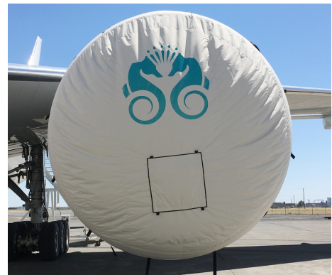
Boeing 777 Intake Covers, GE Engine