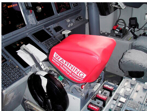
Boeing 737 Throttle Quadrant Cover