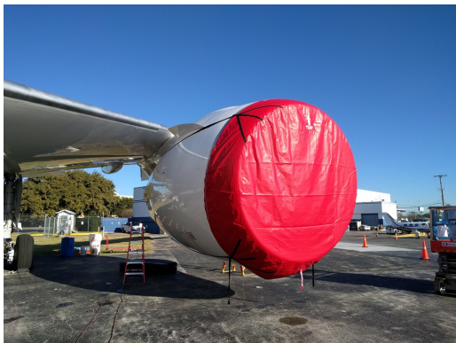
Boeing 787 Intake Cover