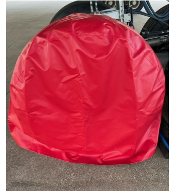
Boeing 777 Main Gear Tire Covers