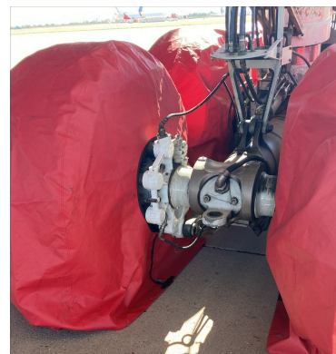
Boeing 777 Main Gear Tire Covers