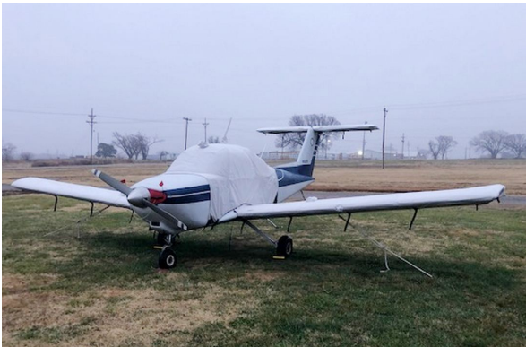
Beech Skipper Extended Canopy Cover, Wing & Horiz. Stab. Covers