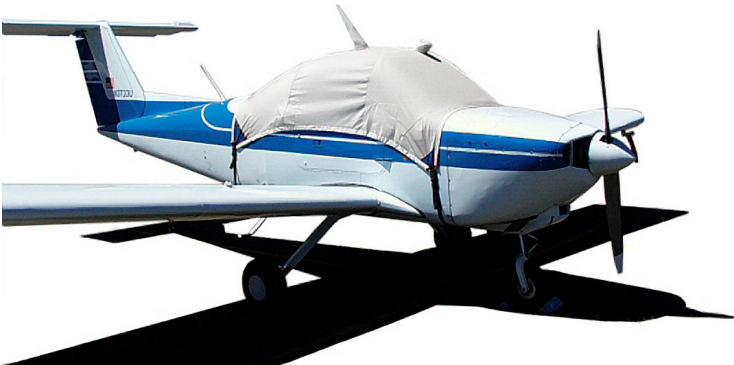
Canopy Cover for Beech Skipper

Travel Covers are made with Silver Solution-Dyed Polyester fabric and only lined over the windshield to save weight. The material is lightweight and more compact for easy stowage in the aircraft. The polyester material is water resistant, but only intended for occasional use outside. We also have an ultra lightweight material available for fitted hangar dust covers. For daily outdoor use, the non-travel Sunbrella Cover is the best choice.