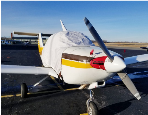
Beech Skipper Extended Canopy Cover and Inlet Plugs

plugs are imprinted with the aircraft registration number in black for an extra charge. Storage bag NOT included. Engine plugs may be inserted after flight when the engine is still warm. Engine Inlet Plugs are commonly referred to as Cowl Plugs, Intake Plugs, Cowl Blocks, Engine Blocks, and Engine Bungs.