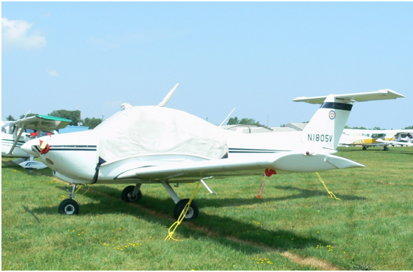
Beech Skipper Extended Canopy Cover, Wing & Horiz. Stab. Covers