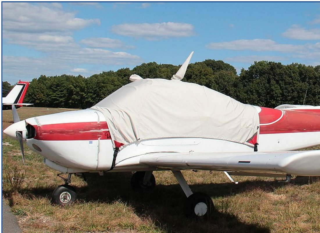
Beech B77 Skipper Canopy Cover