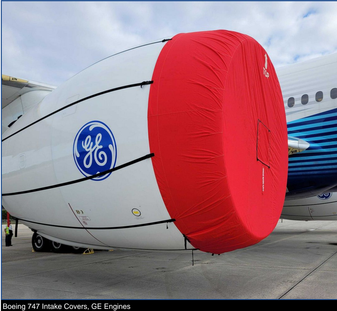
Boeing 747 Intake Covers, GE Engines