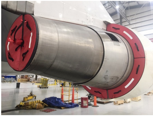
Boeing 747 Bypass Vent & Turbine Exhaust Pugs