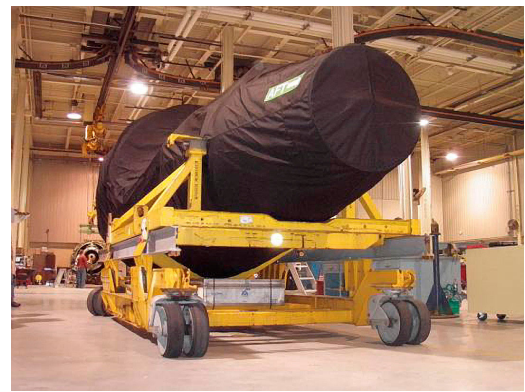
QEC Off-link Engine Cover / Tarp / Bag