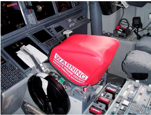
Boeing Throttle Quadrant Cover

ALL-YEAR USE MATERIAL - Made with Silver Acrylic Sunbrella canvas, the all-year use material is the best option for sun protection and cover longevity. This heavier more durable material is intended for all weather conditions, such as rain and snow or lots of sun.