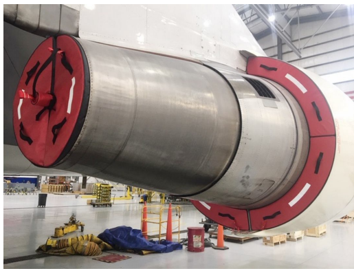
Boeing 747 Bypass Vent & Turbine Exhaust Pugs