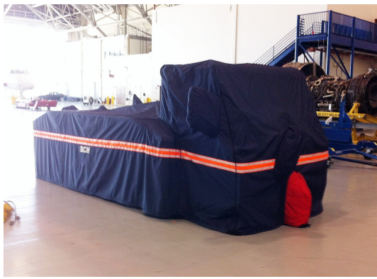
Complete Cover for Eagle Tug