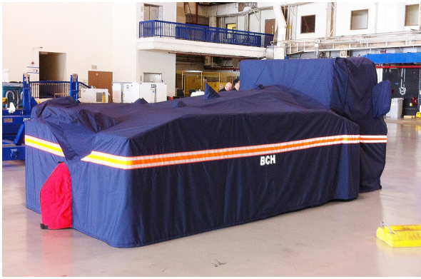
Complete Cover for Eagle Tug