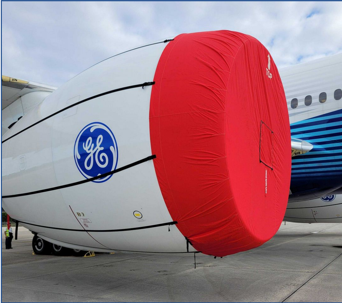
Boeing 747 Intake Covers, GE Engines