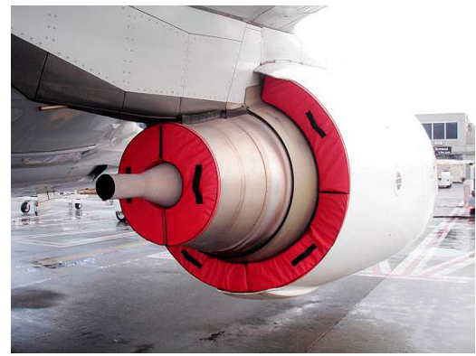
Boeing 737 Bypass and Exhaust Plugs