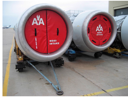
MD-80 JT8D Intake Plugs, Solid Foam folding type& Mesh Center folding type