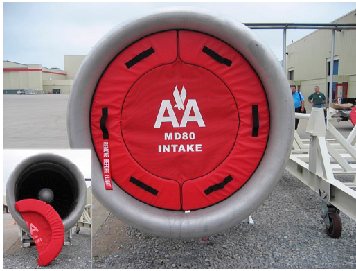
MD-80 JT8D Intake Plug, mesh center & folding type