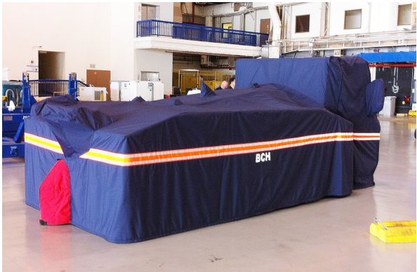
Complete Cover for Eagle Tug