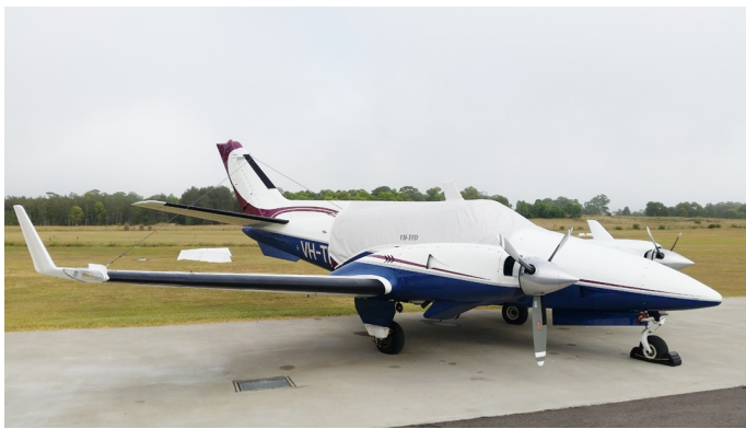
Beech Duke Canopy Cover