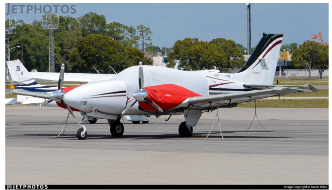
Beech Baron 58, G58 Canopy Cover, Insulated Engine Covers