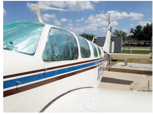
Beech Bonanza Heatshield Set