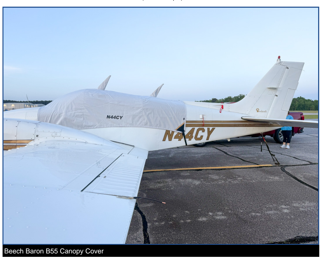
Section 1: Canopy/Cockpit/Fuselage Covers

Canopy Covers help reduce damage to your airplane's upholstery and avionics caused by excessive heat, and they can eliminate problems caused by leaking door and window seals. They keep the windshield and window surfaces clean and help prevent vandalism and theft.