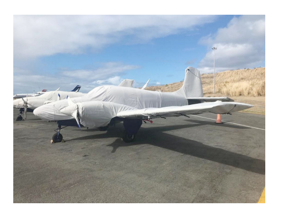
Beech Travel Air Full Cover Set