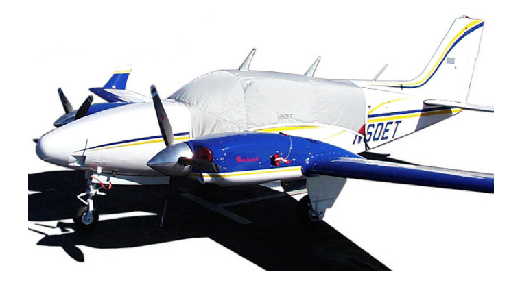
Standard Canopy Cover & Engine Plugs