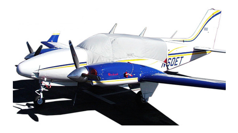
Standard Canopy Cover & Engine Plugs