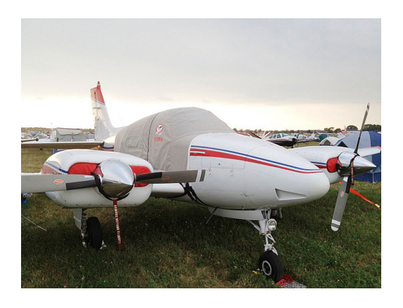
Baron 58 Canopy Cover, Engine Plugs

water resistance, UV resistance and anti-static buildup. The inner lining is a very soft and smooth microfiber to prevent scratching. The material is very reflective, and tests show that the cabin interior temperature can be reduced to near-ambient temperature on the hottest of days. It is water, ice and snow repellent, yet breathable to allow moisture to escape from between the cover and the aircraft surface.