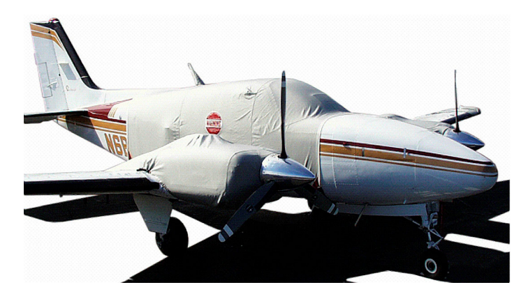
Standard Canopy Cover & Engine Plugs. Extended Canopy Cover & Engine Cover