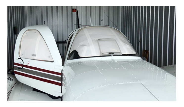
Beech Baron 58P Cockpit Heatshield Set