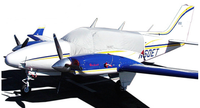
Standard Canopy Cover & Engine Plugs