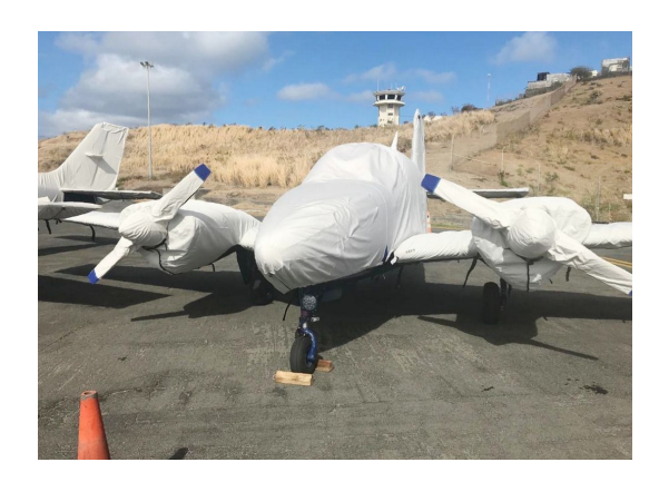
Beech Travel Air Full Cover Set

WINTER USE MATERIAL - Made with Solution-Dyed Polyester fabric, this option is intended for seasonal use to aid in deicing, rain mitigation, or for occasional travel. The material is lighter and more compact, but more susceptible to UV damage and may have a shorter useful life if used continuously outside than the all-year use material.