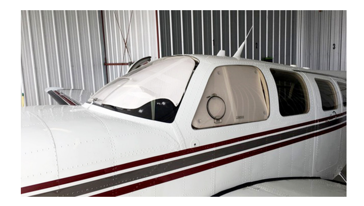
Beech Baron 58P Cockpit Heatshield Set

Windshield Heatshields are interior sunshades for an aircraft's front windshield. The product is a unique composite of closed-cell foam with a silver mylar finish. The semi-rigid design is stiff enough to stand along the inside of the windshield using sun visors or window framing. It folds up flat and easily stores in the included storage sleeve. Some designs may require velcro and suction cups or split right and left sides. A Heatshield is an excellent short-term remedy for cockpit overheating. An external fabric cover is far more effective and practical for long-term protection.