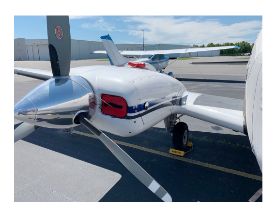
Beech Baron 58 Engine Plugs