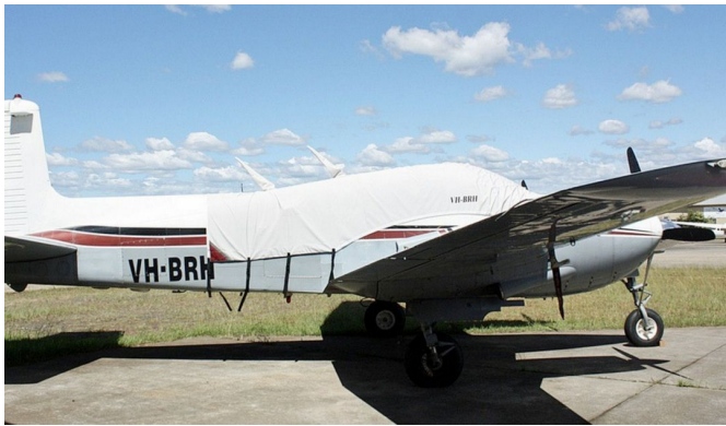
Twin Bonanza Canopy Cover, extends to cover air stair.

This cover type is made from Silver Acrylic Sunbrella canvas and is 100% lined with a soft and smooth microfiber. Bruce's Custom Covers developed this material combination especially for aircraft protection. The outer material is medium weight and treated for water resistance, UV resistance and anti-static buildup. The inner lining is a very soft and smooth microfiber to prevent scratching. The material is very reflective, and tests show that the cabin interior temperature can be reduced to near-ambient temperature on the hottest of days. It is water, ice and snow repellent, yet breathable to allow moisture to escape from between the cover and the aircraft surface.