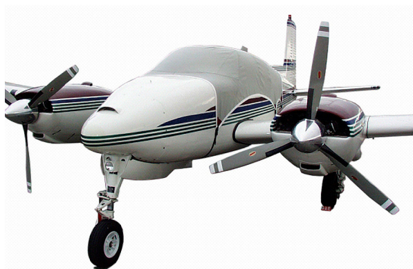
Twin Bonanza Standard Canopy Cover

Travel Covers are made with Silver Solution-Dyed Polyester fabric and only lined over the windshield to save weight. The material is lightweight and more compact for easy stowage in the aircraft. The polyester material is water resistant, but only intended for occasional use outside. We also have an ultra lightweight material available for fitted hangar dust covers. For daily outdoor use, the non-travel Sunbrella Cover is the best choice.