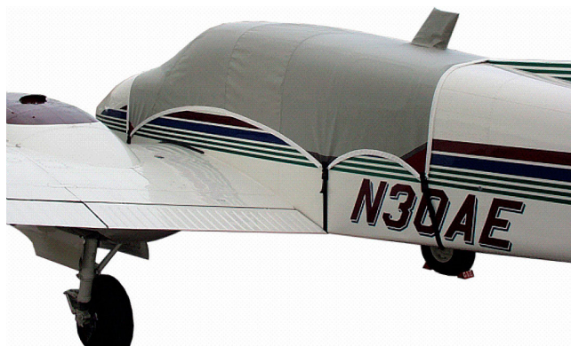
Twin Bonanza Standard Canopy Cover