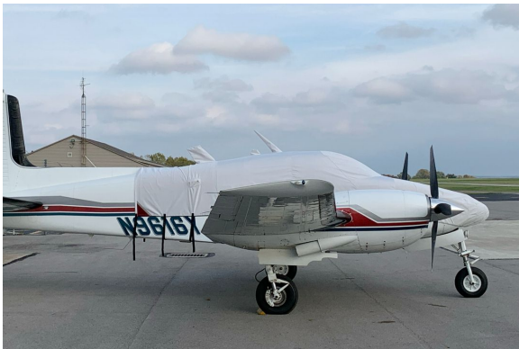
Beech Twin Bonanza Canopy/Nose Cover

This cover type is made from Silver Acrylic Sunbrella canvas and is 100% lined with a soft and smooth microfiber. Bruce's Custom Covers developed this material combination especially for aircraft protection. The outer material is medium weight and treated for water resistance, UV resistance and anti-static buildup. The inner lining is a very soft and smooth microfiber to prevent scratching. The material is very reflective, and tests show that the cabin interior temperature can be reduced to near-ambient temperature on the hottest of days. It is water, ice and snow repellent, yet breathable to allow moisture to escape from between the cover and the aircraft surface.