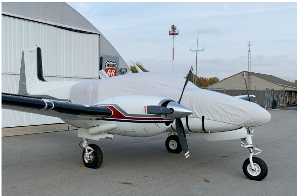
Beech Twin Bonanza Canopy/Nose Cover