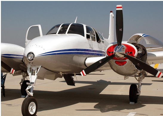
Beech Twin Bonanza Engine Inlet Plugs