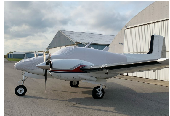
Beech Twin Bonanza Canopy/Nose Cover