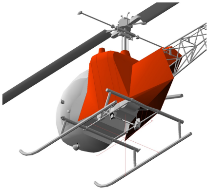
Bell 47 Engine Area Cover, 3D model

WINTER USE MATERIAL - Made with Solution-Dyed Polyester fabric, this option is intended for seasonal use to aid in deicing, rain mitigation, or for occasional travel. The material is lighter and more compact, but more susceptible to UV damage and may have a shorter useful life if used continuously outside than the all-year use material.