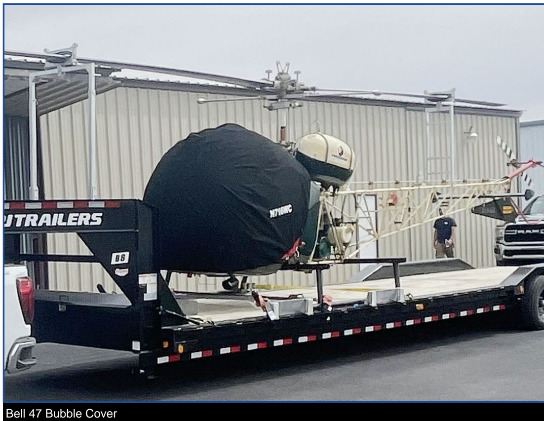
Bell 47 Bubble Cover