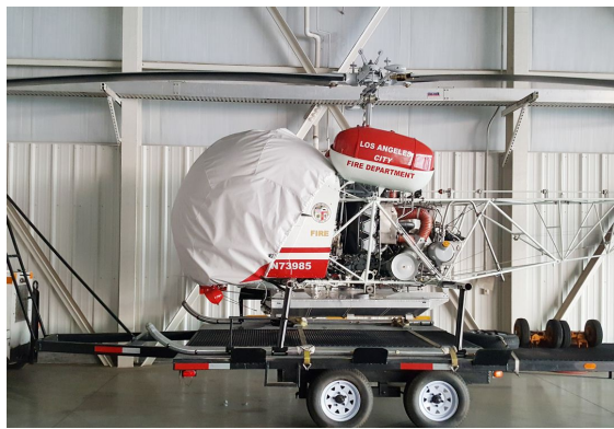
Bell 47G Bubble Cover