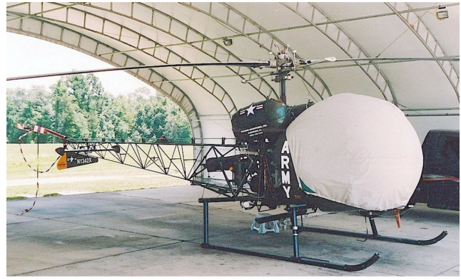
Bell 47 Bubble Cover