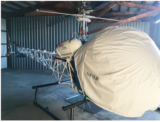
Bell 47 Bubble Cover