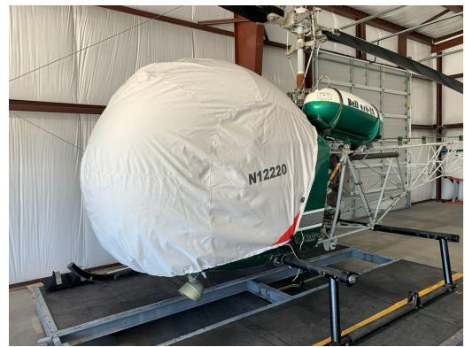
Bell 47 Bubble Cover