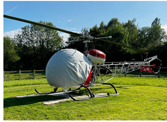
Bell 47G5 Bubble Cover