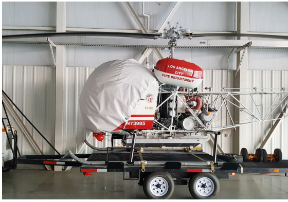
Bell 47G Bubble Cover