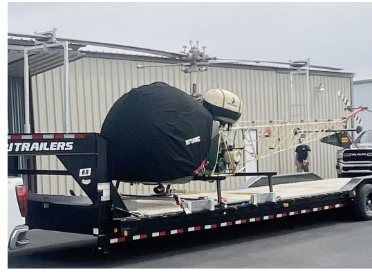
Bell 47 Bubble Cover