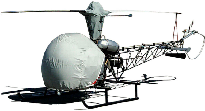
Bubble and Main Rotor Mast Covers

WINTER USE MATERIAL - Made with Solution-Dyed Polyester fabric, this option is intended for seasonal use to aid in deicing, rain mitigation, or for occasional travel. The material is lighter and more compact, but more susceptible to UV damage and may have a shorter useful life if used continuously outside than the all-year use material.