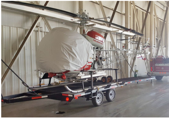
Bell 47G Bubble Cover