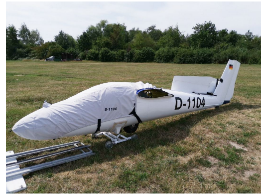
Pilatus B-4 Canopy/Nose Cover