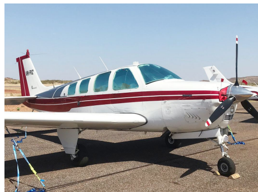
Beech A-36 Bonanza Cabin HeatShields