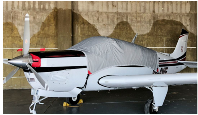
Beech Bonanza V35A Travel Canopy/Engine Cover