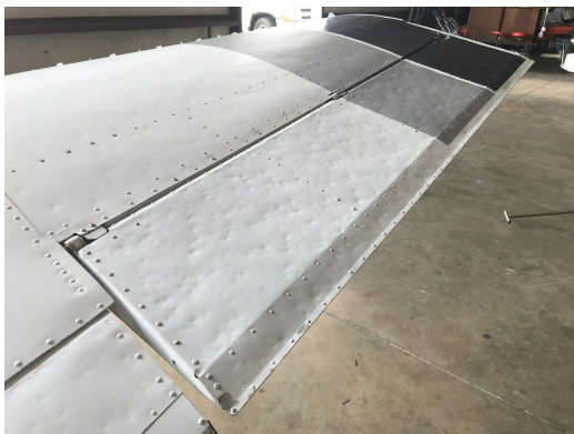
Beech Bonanza Hail Damaged Wing

WINTER USE MATERIAL - Made with Solution-Dyed Polyester fabric, this option is intended for seasonal use to aid in deicing, rain mitigation, or for occasional travel. The material is lighter and more compact, but more susceptible to UV damage and may have a shorter useful life if used continuously outside than the all-year use material.