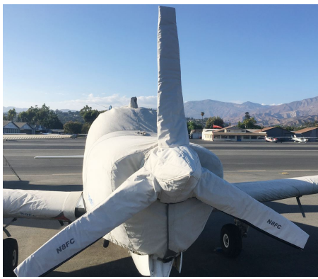
1964 Beech Bonanza Insulated Propellor/Spinner Cover