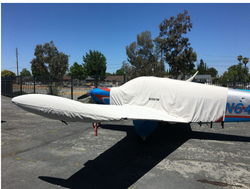
Beech Bonanza A36 Wing Covers with D'Shannon Tip Tanks, Extended Canopy Cover