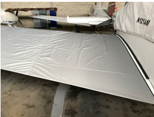
Beech Bonanza Wing Covers