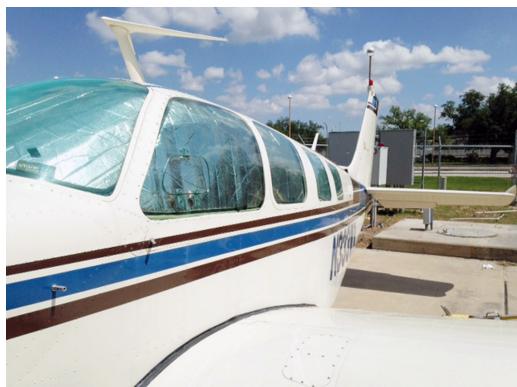
Beech Bonanza HeatShields

Windshield Heatshields are interior sunshades for an aircraft's front windshield. The product is a unique composite of closed-cell foam with a silver mylar finish. The semi-rigid design is stiff enough to stand along the inside of the windshield using sun visors or window framing. It folds up flat and easily stores in the included storage sleeve. Some designs may require velcro and suction cups or split right and left sides. A Heatshield is an excellent short-term remedy for cockpit overheating. An external fabric cover is far more effective and practical for long-term protection.