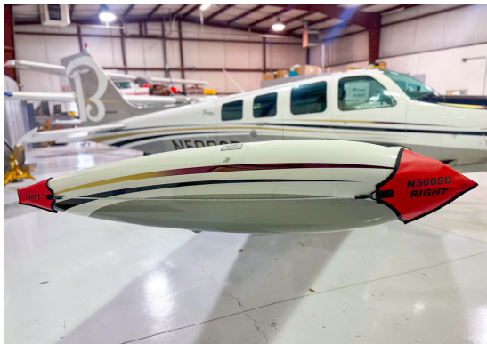
Beech A36 Fresh Air Inlet/Exhaust Plugs Tip Tank Safety Pads

Designed to prevent damage to the aircraft extremities in crowded hangars, these products are made of bright red Naugahyde and thickly padded with a sandwich of closed cell foam.