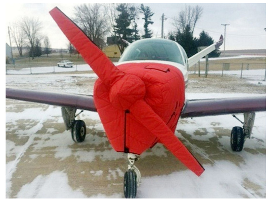
Bonanza Insulated Engine and Prop Cover