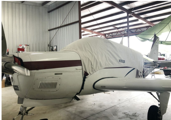
A36 Engine Inlet Plugs

these products are made of bright red Naugahyde and thickly padded with a sandwich of closed cell foam.