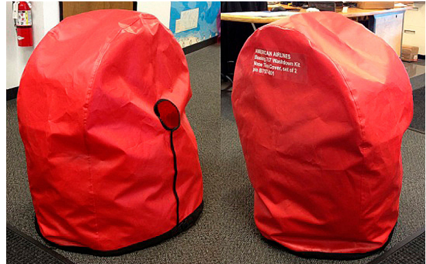
Boeing 757 Tire Covers, great for Wash Prep or Storage