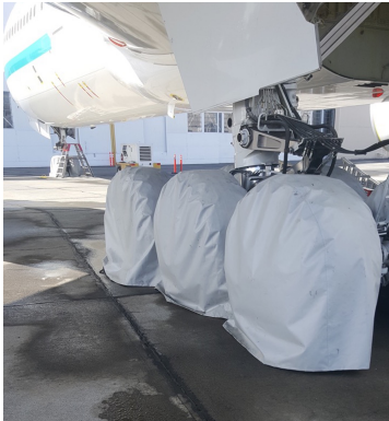
Boeing 777 Main & Nose Gear Tire Covers

ALL-YEAR USE MATERIAL - Made with Silver Acrylic Sunbrella canvas, the all-year use material is the best option for sun protection and cover longevity. This heavier more durable material is intended for all weather conditions, such as rain and snow or lots of sun.