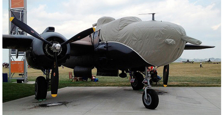
B26 Cockpit/Nose and Gun Turret Covers