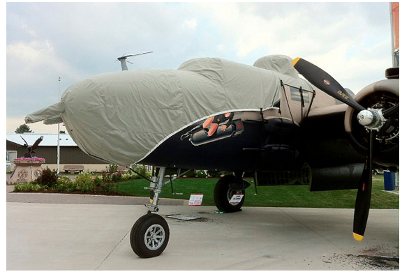
B25 Cockpit/Nose and Gun Turret Covers