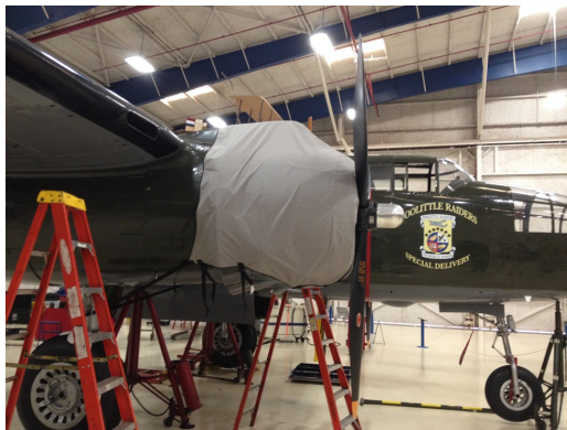
B26 Engine Cover

Engine Covers will cinch around or behind the spinner, cover the entire engine cowl area including the engine air cooling and induction air inlets, and fastens together with Velcro beneath the spinner down the front of the cowling. The Engine Cover is attached with a belly strap aft of the firewall, and can Velcro to the Canopy Cover. Engine Covers are normally made from Solution-Dyed Polyester or Acrylic Sunbrella . An Insulated version of the engine cover can be made with a thicker, quilted, and water-repellent material. The Insulated Engine Cover works well in cold climates to help with engine preheating.