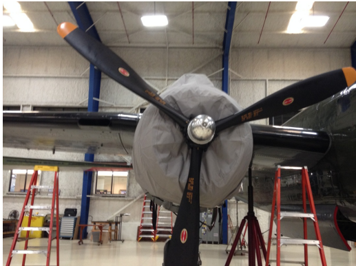
B25 Engine Cover

Engine Covers will cinch around or behind the spinner, cover the entire engine cowl area including the engine air cooling and induction air inlets, and fastens together with Velcro beneath the spinner down the front of the cowling. The Engine Cover is attached with a belly strap aft of the firewall, and can Velcro to the Canopy Cover. Engine Covers are normally made from Solution-Dyed Polyester or Acrylic Sunbrella . An Insulated version of the engine cover can be made with a thicker, quilted, and water-repellent material. The Insulated Engine Cover works well in cold climates to help with engine preheating.