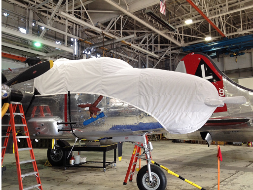
B26 Cockpit/Nose Cover

This cover type is made from Silver Acrylic Sunbrella canvas and is 100% lined with a soft and smooth microfiber. Bruce's Custom Covers developed this material combination especially for aircraft protection. The outer material is medium weight and treated for water resistance, UV resistance and anti-static buildup. The inner lining is a very soft and smooth microfiber to prevent scratching. The material is very reflective, and tests show that the cabin interior temperature can be reduced to near-ambient temperature on the hottest of days. It is water, ice and snow repellent, yet breathable to allow moisture to escape from between the cover and the aircraft surface.