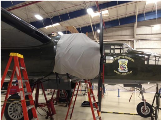
B25 Engine Cover