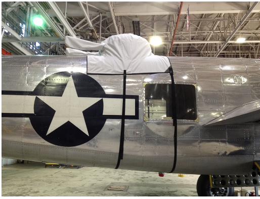
B25 Gun Turret Cover